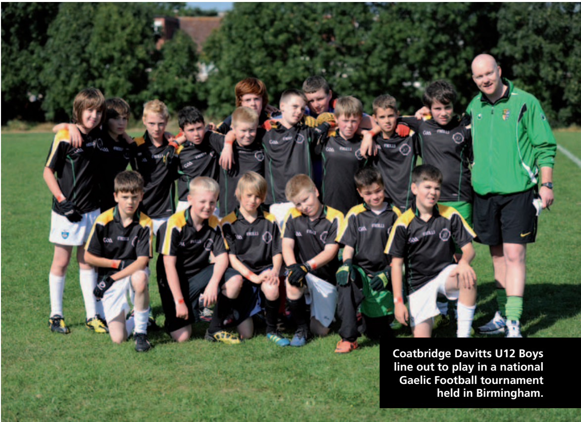
Coatbridge Davitts U12 Boys line out to play in a national Gaelic Football tournament held in Birmingham.