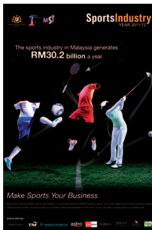
An advert promoting the year of Sports Industry in Malaysia.

"Now the foundations have been laid to build the capacity of a vibrant and sustainable sports industry in Malaysia, we look forward to seeing progress go from strength-to-strength."