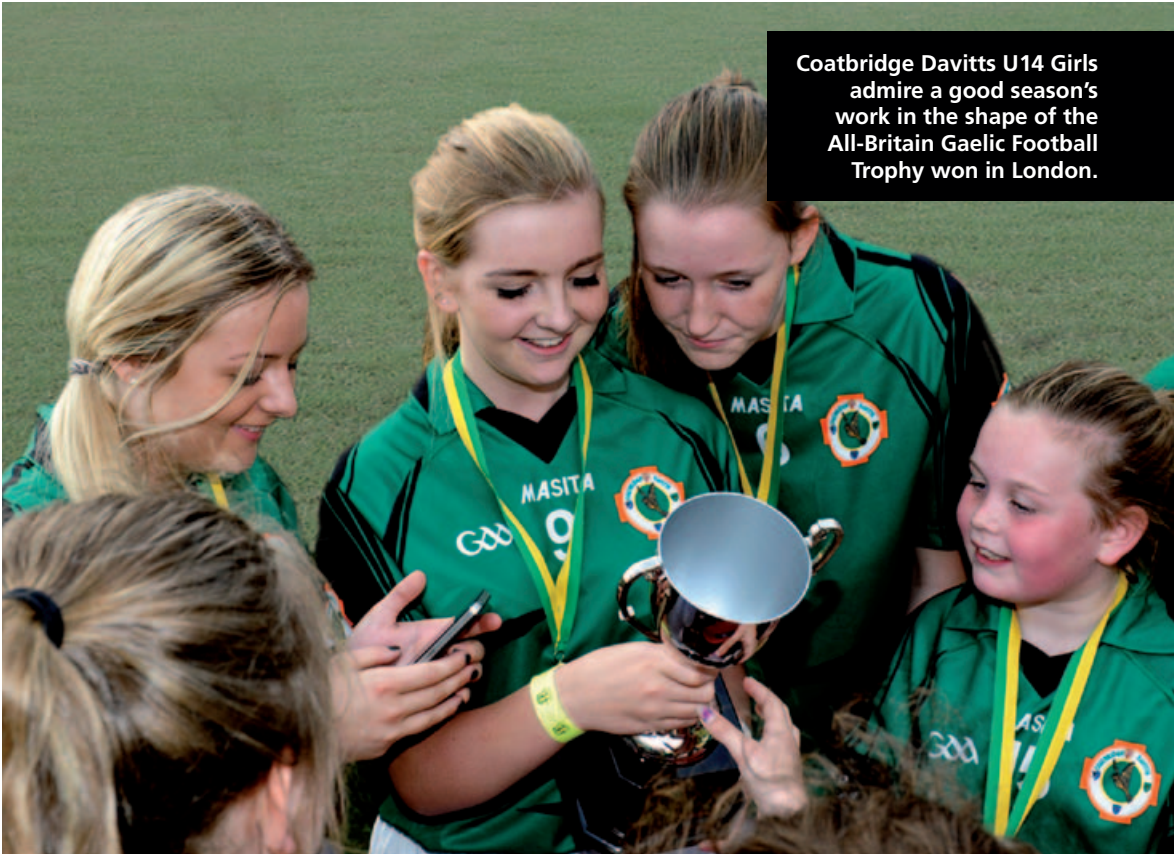
Coatbridge Davitts U14 Girls admire a good season's work in the shape of the All-Britain Gaelic Football Trophy won in London.