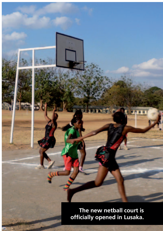
The new netball court is officially opened in Lusaka.