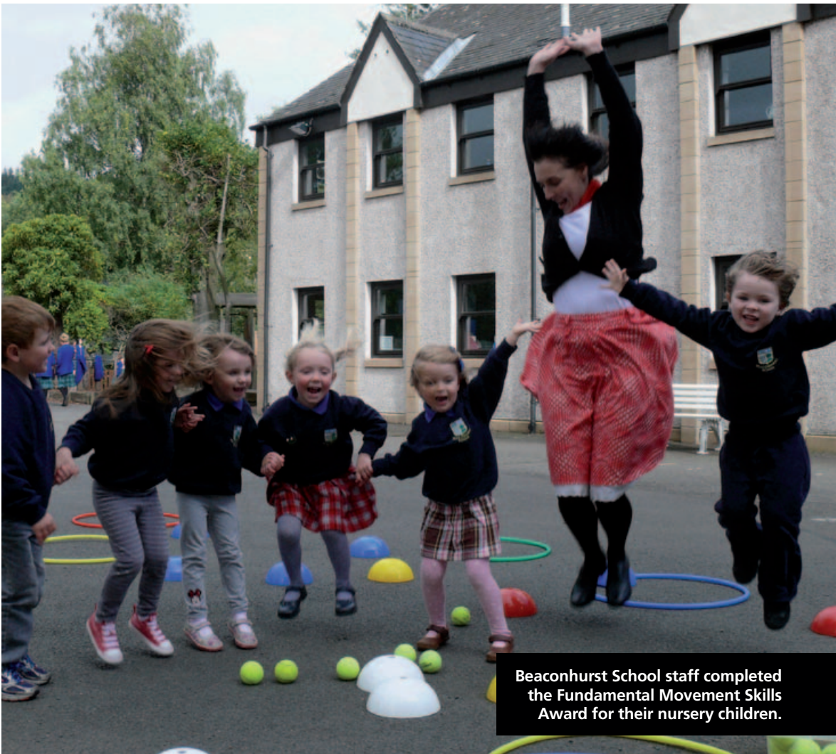
Beaconhurst School staff completed the Fundamental Movement Skills Award for their nursery children.