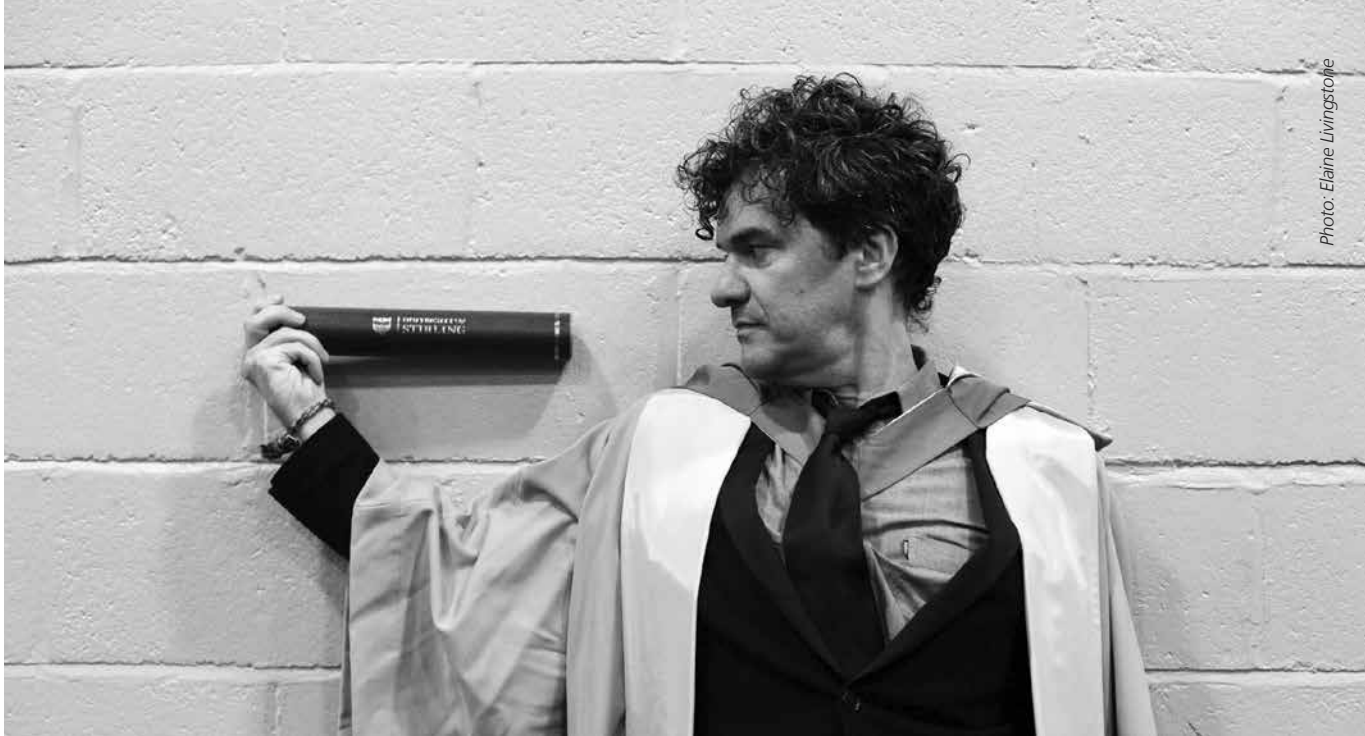
Mark Cousins, University of Stirling honorary graduate.