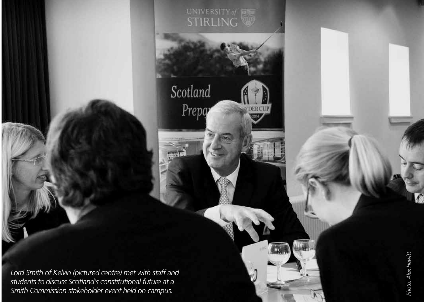
Lord Smith of Kelvin (pictured centre) met with staff and students to discuss Scotland's constitutional future at a Smith Commission stakeholder event held on campus.