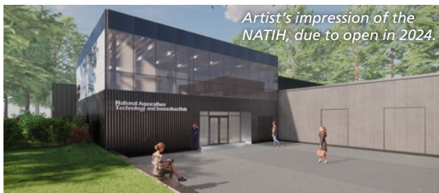
Artist's impression of the NATIH, due to open in 2024.