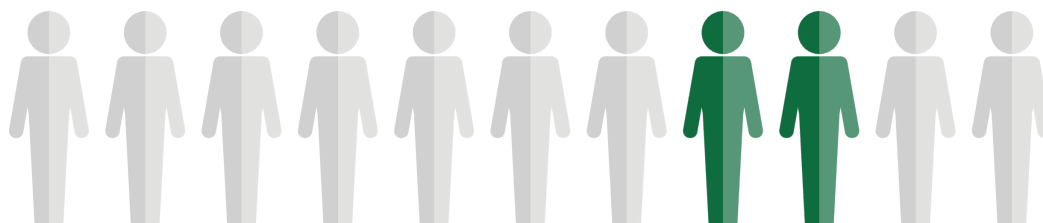
January 2016 (pre-NCRM)