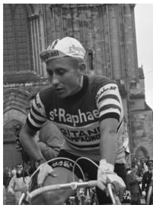
Pro-doping: Jacques Anquetil

While allowing doping would be controversial, there are comparisons. In boxing, for instance, modern-day participants know and accept the risk that they could incur brain injuries. In that sense, if all cyclists accepted the use of drugs in the sport then their decision would be a similar one based on the health risk that such drug use involves.