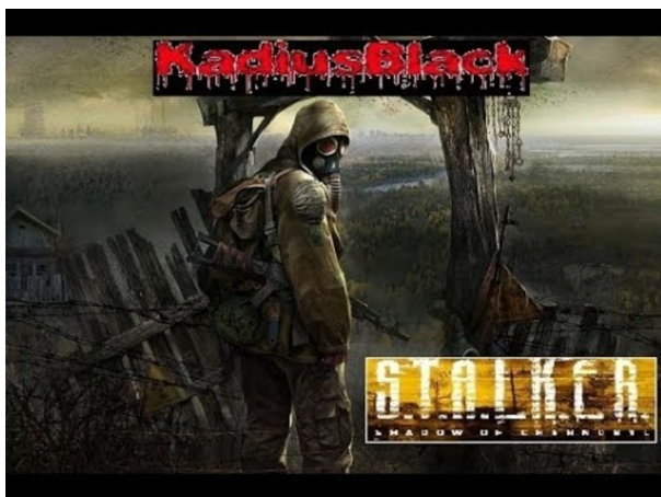
The S.T.A.L.K.E.R video game.

In the latter, teenage Chernobyl survivor Artyom loses his father, who was ordered to help cut down and bury irradiated trees, to radiation poisoning. The book is about Artyom remembering his father and revisiting the forest he once worked in, where he sees his father’s shadow dancing around. In this and many other stories, the exclusion zone is represented as a (sometimes supernaturally) haunted ghost town. Horror stories such as the film Chernobyl Diaries (2012) and the videogame series S.T.A.L.K.E.R (2007-2009) seek to thrill audiences with fear of the zone as much as to educate them about it.