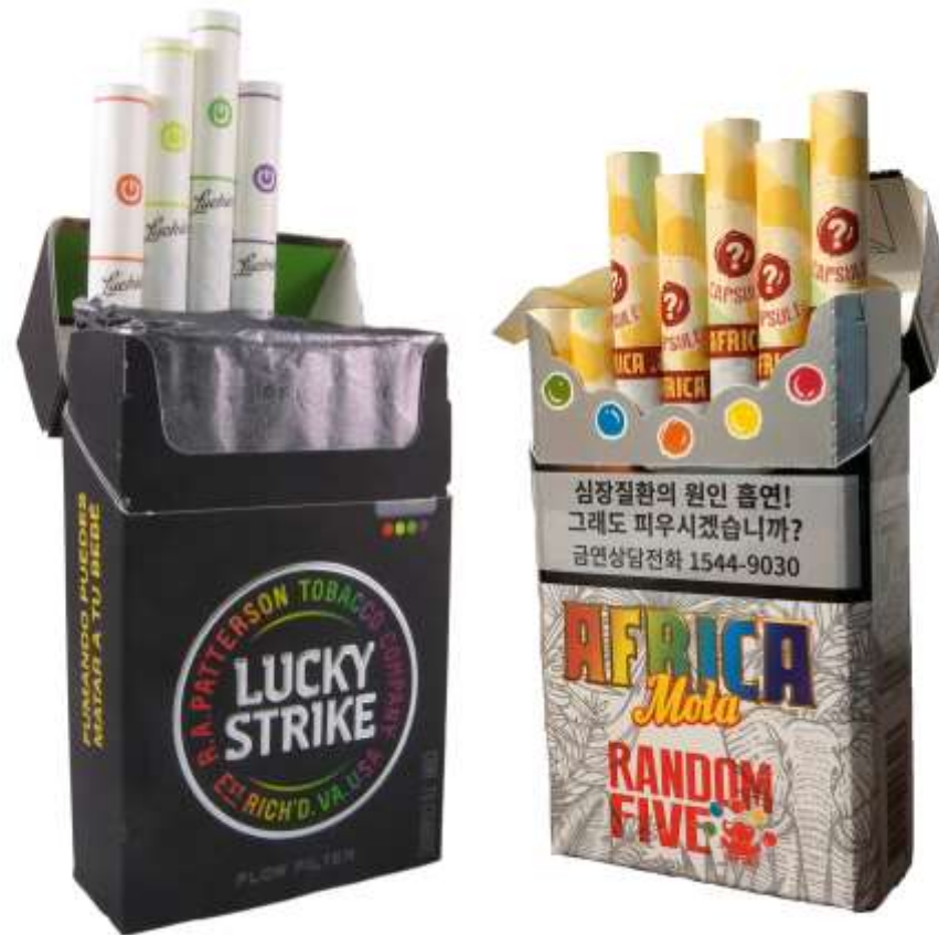
Figure 2: Lucky Strike Click 4 Mix, containing four different flavoured capsules, and Africa Mola, containing five different flavoured capsules