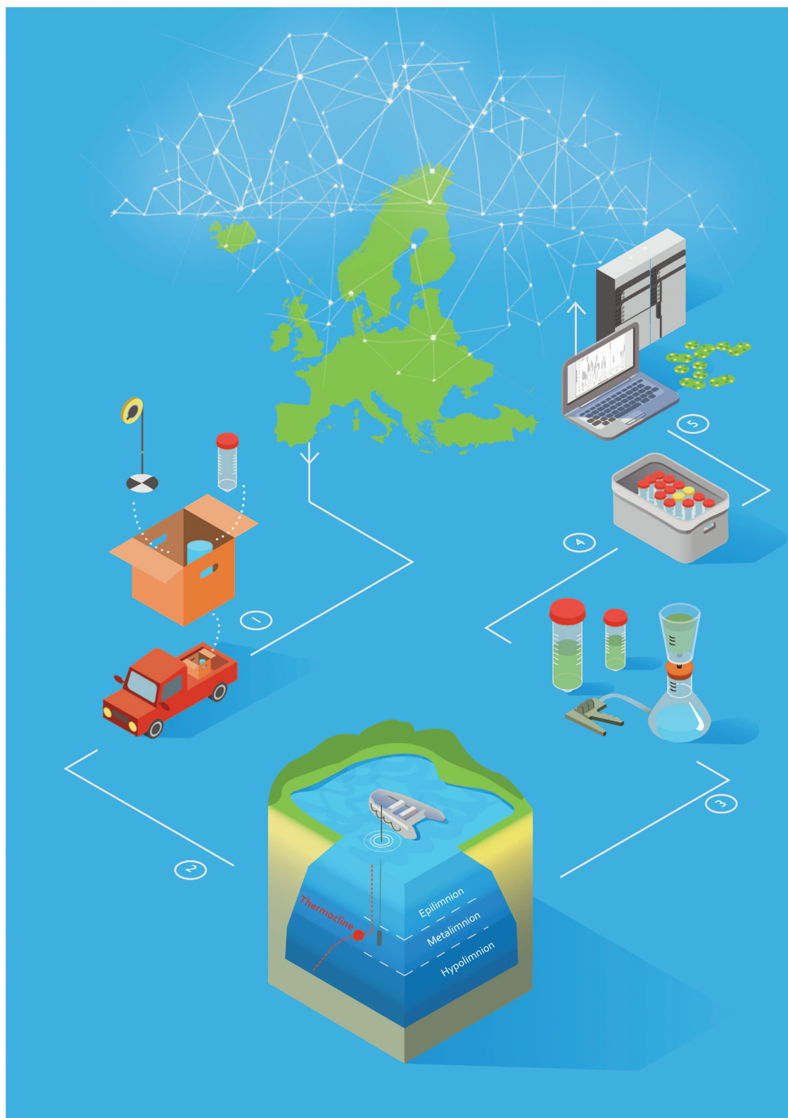
Figure 2. Schematic overview of the European Multi Lake Survey (EMLS). CyanoCOST and NETLAKE members performed the sampling routine by: 1. Preparing the sampling material to meet the standardized procedures 2. Accessing the lake site and acquiring integrated water samples from the bottom of the thermocline up to the water surface 3. Processing and preserving the water samples based on requirements for subsequent analysis 4. Shipping samples to a central receiving laboratory 5. Analysing nutrient, pigment and toxin concentrations in dedicated laboratories. After quality control checks and data integration the dataset returns to the European network and becomes publically available for further research. Created by Sarah O’Leary and Eilish Beirne.