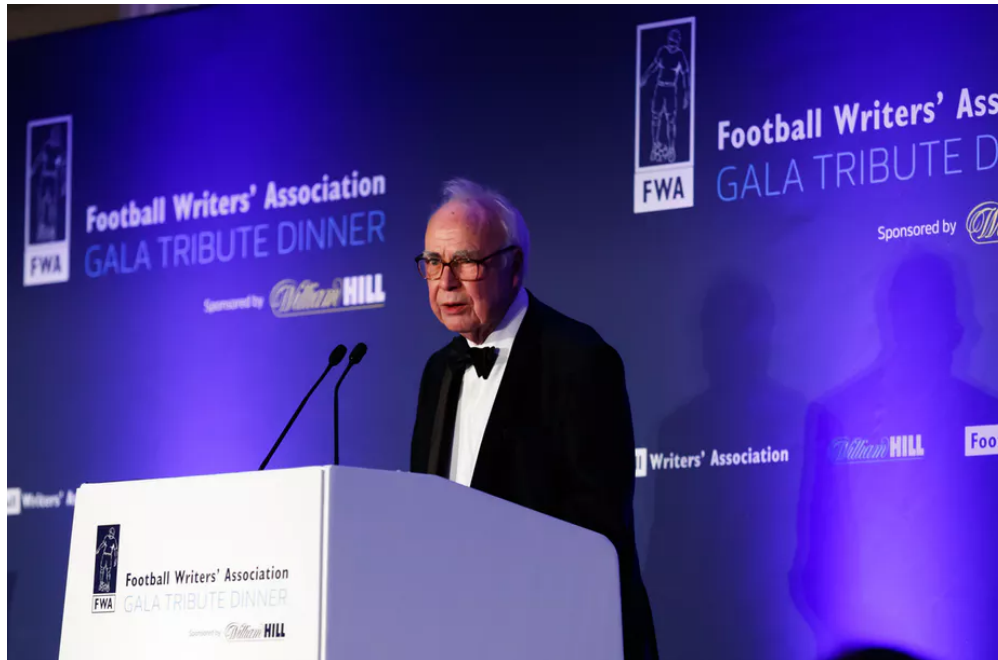
Britain's greatest sportswriter at the Football Writers' Association tribute night in 2018.