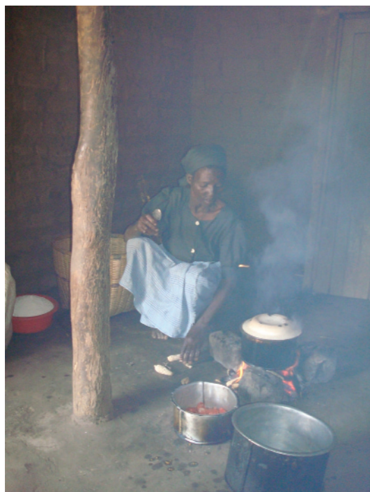
Figure 1 Woman cooking indoors in rural Chikwawa. In the dry season it is more common to cook outdoors or on the veranda (khondi). However, in the wet season or the evenings cooking is often conducted indoors. The situation in the urban environment is similar although indoor cooking (and heating) is more frequent because of cooler average temperatures.

from and 1200 m lower altitude than urban Blantyre. The urban homes were randomly selected from 360 Blantyre residents who had previously volunteered for studies at the Malawi-Liverpool-Wellcome Trust Clinical Research Programme (MLW). Selected homes were then visited by a fieldworker, and the residents invited to participate. Rural entomology studies based in Chikwawa had established contacts with the local health surveillance officers in the area. Contact was made with village elders through health surveillance officers and the project was explained to the community. Village homes are similar in design and construction; the first home was chosen as closest in a random direction from the village elder's house and a snowball sampling strategy was then used to select the other homes. The study was carried out during April 2008 (dry season).