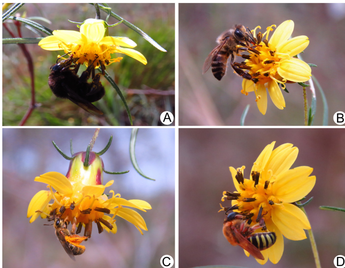
Figure 1. Some of the most frequent bee pollinators of Aspilia jolyana . A. Bombus pauloensis ; B. Apis mellifera ; C. Pseudoagapostemon ochromerus ; D. Melipona quinquefasciata .

the richness of pollinators to 31 species, performing 442 visits. However, only a conservative estimate of 29.0% species/morphospecies ( n=9 ) found here were also recorded by Carstensen et al. (2014). This suggests that potential pollinators associated to Aspilia jolyana are more diverse than reported by both studies.