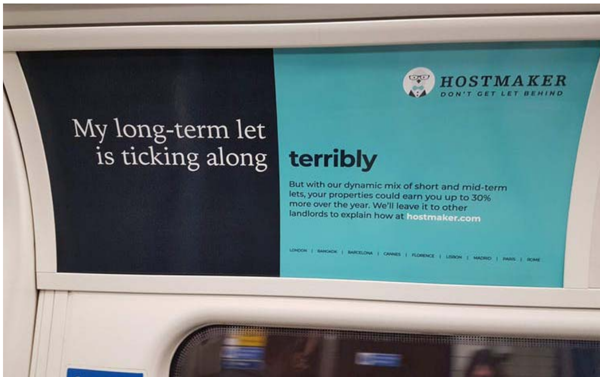
Hostmaker advert on the London tube. Generation Rent

Part of the issue is the continued commodification of housing, and the attitudes of landlords who view their properties as an investment , rather than as someone's home. This was encapsulated in recent adverts by letting company Hostmaker, which subtly promoted a move away from long-term tenants in favour of the short-term market.