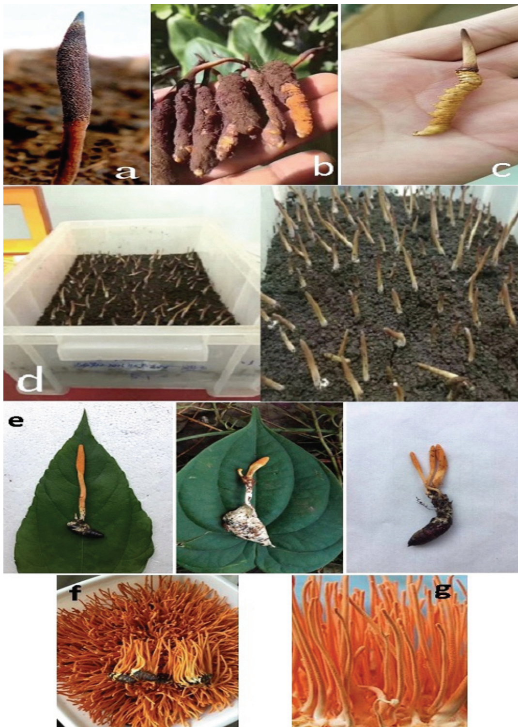
Medicinally important Cordyceps species: (a) Cordyceps sinensis mature fruiting body in the wild, (b) C. sinensis dug out from soil, (c) dry C. sinensis product, (d) artificial Ophiocordyceps sinensis on living caterpillars, (e) Cordyceps militaris growing in the wild, (f) artificial C. militaris growing on insects, (g) artificial Cordyceps militaris growing on a culture medium.

militaris cultivation has been further advanced, resulting in a high yield of stromata production and high content of Cordycepin [75,83]. C. militaris cultivation was also investigated using different media [84–86].