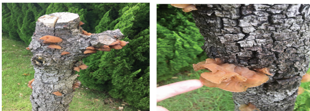
Jelly mushroom Auricularia spp.