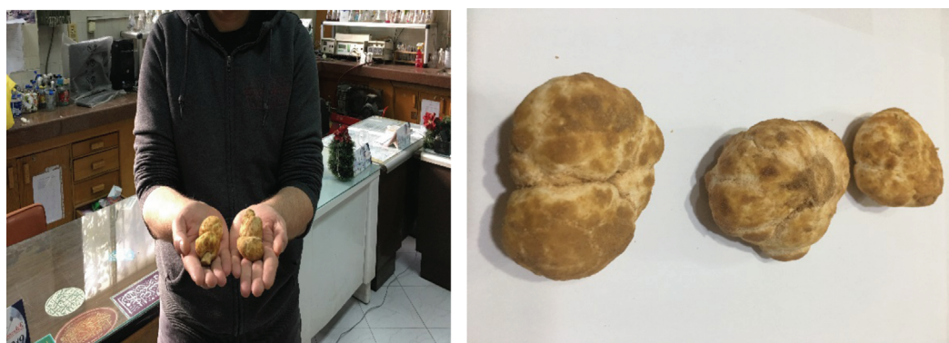
Truffles Ex. Tirmania spp.