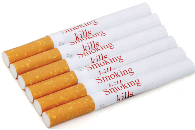
Figure 1. Warning on cigarettes.

to respond to questions at the start of each group, they were informed that their views may differ and when answering they should not be influenced by anyone else within the group or the interviewer(s). Groups typically lasted 90 minutes, after which participants were debriefed about the study and received an incentive fee (£25). Ethical approval was obtained from the Ethics Committee of the School of Management at the University of Stirling.