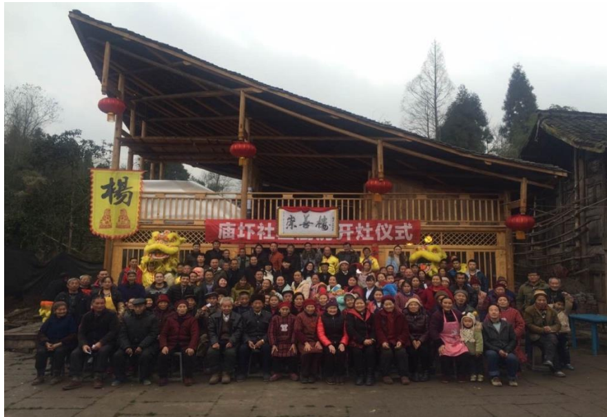
Figure 8. The inauguration of Temple Community kitchen