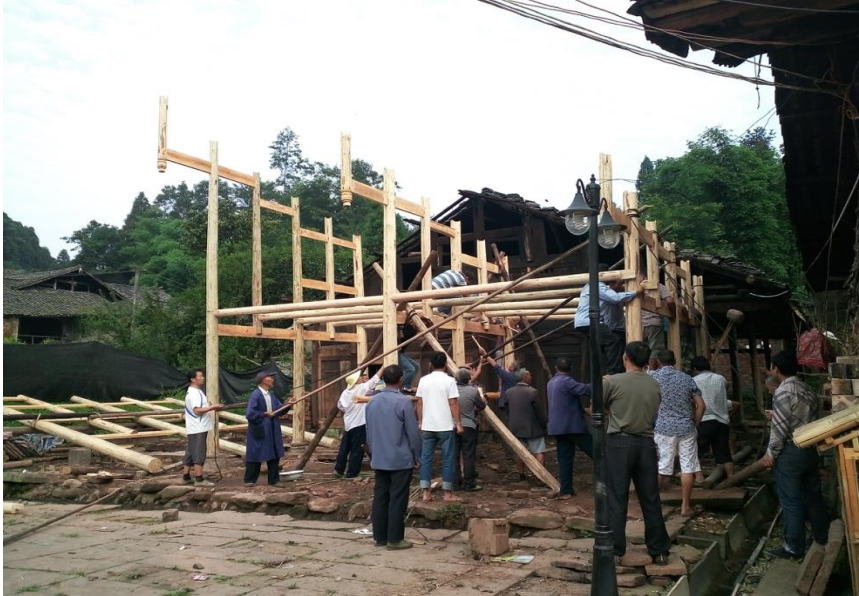
Figure 6: Villager setting up the frame of building collectively

Mechanical tools limited to a portable bench saw, grinder and electric drills, were used to shape and frame parts from unmilled timbers within the building under the master carpenter's supervision. No nails were utilized in their assembly and wooden joints were wedged to precise tolerances. The frames were assembled flat on the ground and pulled vertically (like barn constructions) to ensure precision. Villagers, social workers and volunteers participated with the carpenter's team to erect the assembled frames on site. Builders used the models for reference. Collective action and participation proved essential to collective ownership of the building. The research team admired the skills and collective spirit of master carpenters and villagers which fostered a high level of craftsmanship and speed in the building