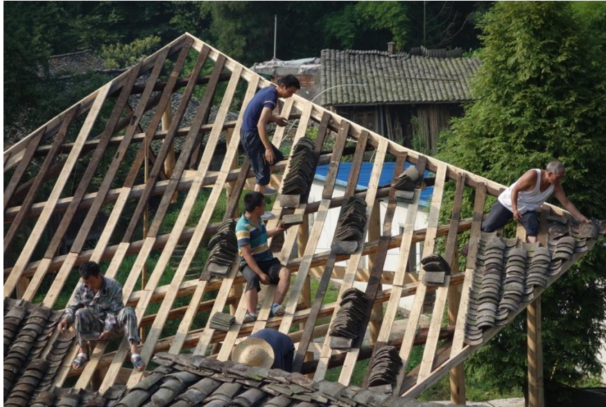
Figure 7: Social workers and villagers doing tiling

After completing the frame, the carpenter and villagers connected and wedged the erected frame. As a no-nails construction, they also tightened the frame when the wood dried and finishing details were completed. Tiling the roof frame became a collective endeavour. Twenty participants completed the tiling in one morning (see Figure 7). Important topping out and finishing ceremonies included the burning of incense, a traditional ritual for praying for the safety of the building. The construction process effectively mobilized community support and participation, especially among older people, and crossed boundaries when Hong Kong student volunteers joined villagers. These actions generated a sense of collective ownership and community