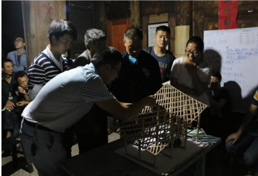
Figure 4. Participatory design workshop

Social workers invited villagers to the final design workshop. The room, was absolutely crowded with people, especially older ones. The designer gave a final presentation that highlighted ownership issues. This resulted in design modifications and adjustments to the final design. The proposal was that the roof system rotates 30 degrees from the column grid and roof beams positioned at different heights to give shape to the curved roof. Older villagers and the carpenter criticized the curved roof's final design and structure. Some villagers thought the design did not follow their traditions; others were unconvinced about the structural stability of the curved roof; and others rejected it. Final confirmation rested with the villagers. The presentation to the carpenter team initially caused consternation. Social workers facilitated dialogue