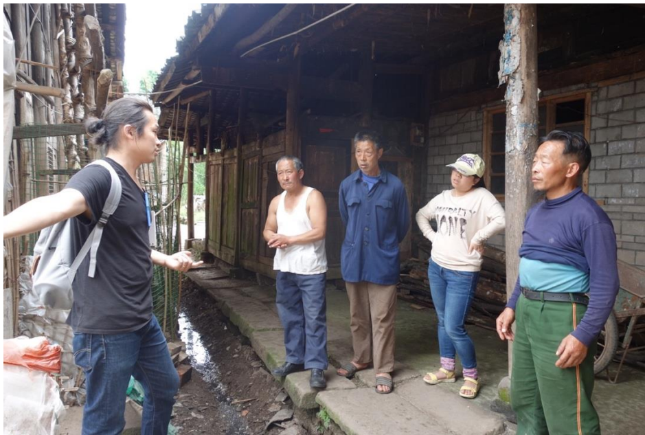
Figure 2: Hong Kong architect interviewing local elders about the local culture and traditional construction

architect and social workers learned from local building masters about traditional construction processes, finishing details, skills and local materials. The architect employed anthropological ethnographic methods, e.g., staying with villagers, to understand their living habits. The research team undertook community measurements, found local second-hand materials like wood, tiles, and bamboo for recycling in community rebuilding, following green social work principles.