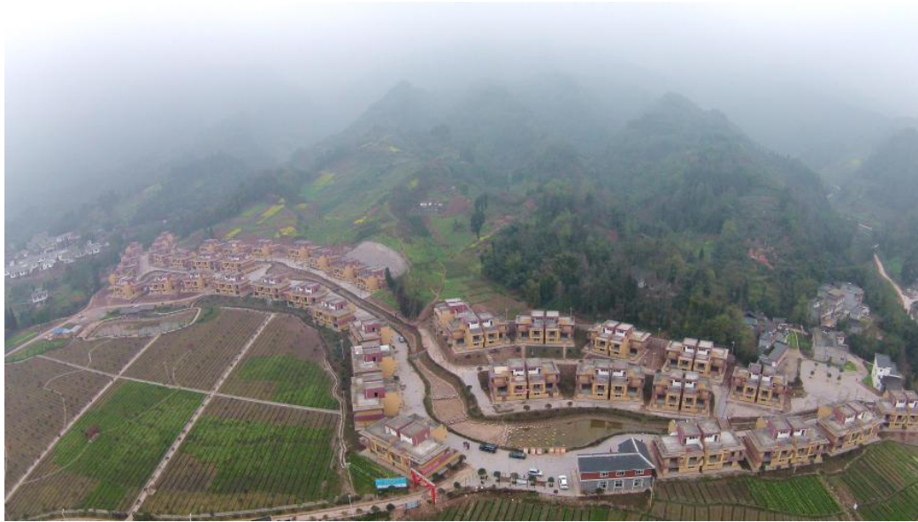
Figure 1: Rebuilt housing estate in S township

The Chinese government's efficiency in building houses for victim-survivors of natural calamity is impressive. However, from a social work perspective, the rebuilding process in Sichuan's earthquakes lacks democratic underpinnings because those belonging to marginal groups, particularly older people, children, and minority ethnic groups, are excluded from design and implementation processes. Moreover, core concerns have not been seriously considered and addressed in rebuilding processes.