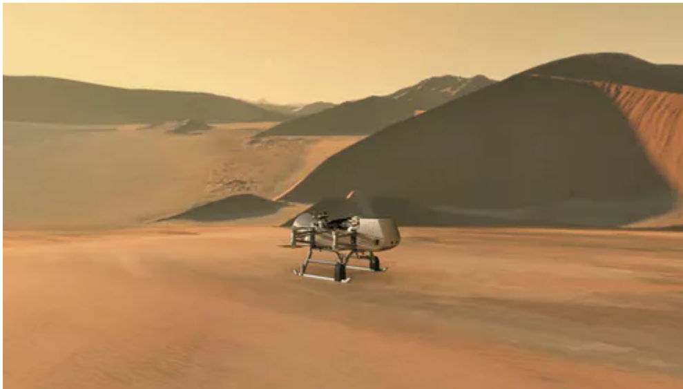
Artist's impression of the Dragonfly landing.