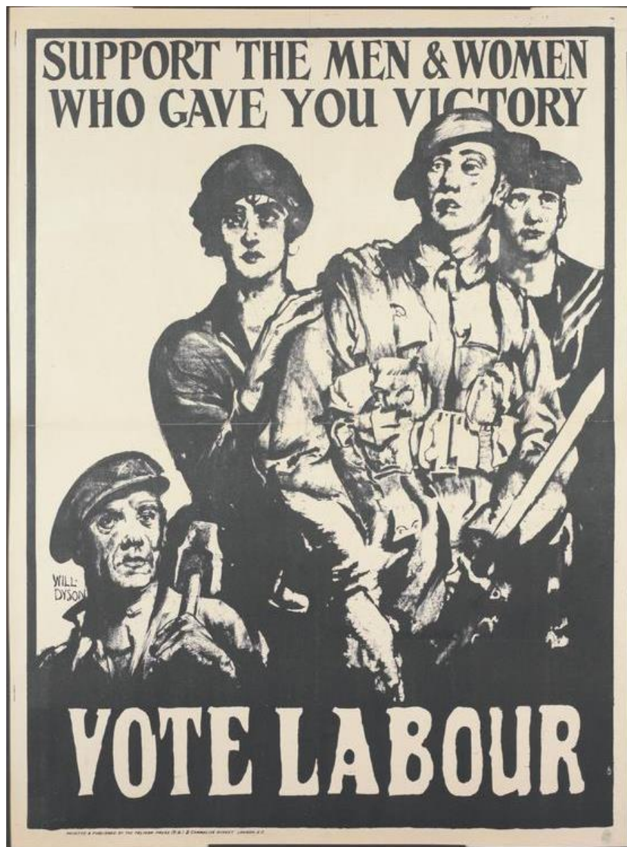
Fig. 5. 1918 Labour election poster. 149

As Jon Lawrence pointed out in his study of Wolverhampton politics, 'the ideal of progressive co-operation had not been wholly expunged' by the circumstances of the war and there is good evidence that the tradition of the 1903 Gladstone-MacDonald agreement did continue in the West Midlands. 150 Alfred Hazel stood down in West Bromwich, complaining that 'the Coalition wire-pullers are trying to effect the political