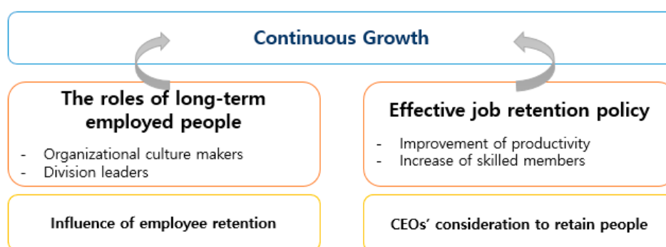
Figure 2. Conceptual framework of impact factors related to growth of business.

The literature review suggests that the factors influencing job retention are closely related. Job satisfaction influences job performance, job retention, and motivation. In this section, factors related to employee retention are discussed in terms of the roles played by long-term employees, the influence of employee turnover, CEOs' methods of retaining people, and effective job retention policy for the growth of the business. These complicated relationships are illustrated in the conceptual framework shown in Figure 2.