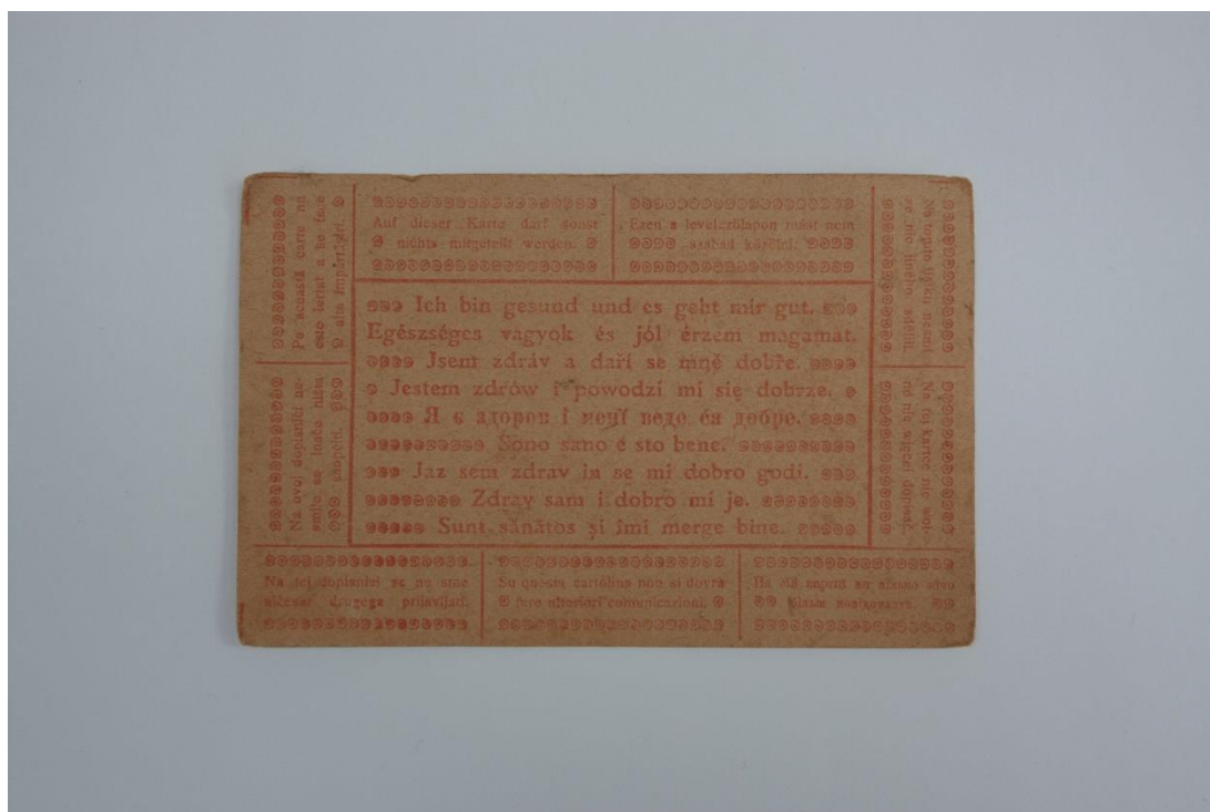
Figure 1. The Austro-Hungarian multilingual postcard. Kobarid Museum.

One of the most multilingual objects at the Kobarid Museum is the imposing wooden door of a military prison. This door was originally located in the village of Smast, a few kilometres from Kobarid, where several units were posted for 29 months until 1917. Among them was the 46th Italian infantry division, which partially retreated from the attacks on the Mrzli mountain and was therefore imprisoned, alongside Russian and Austrian prisoners. Although “many did not leave any trace, given that at that time more than half of the soldiers of the Italian infantry was illiterate”, these prisoners left “their stories, information, beliefs” or just their signatures (Cimprič 2011: 96; our translation) on the door in German, Italian and Russian (Cyrillic). For instance: