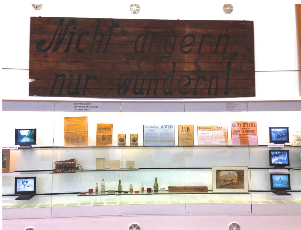
Figure 3. The wooden board with the inscription "Nicht ärgern, nur wundern". Historial de la Grande Guerre.

This kaleidoscope of meaning is only apparent through sustained analysis of the object and its inscription and the original misunderstanding would not be immediately accessible to visitors, even if they were German-speaking. It can be explained in text labels and indeed this object's biography is given on one of the multi-media screens in the same room. This wooden board and its inscription are witness to the complexities of languages and translation, as Baker argues, in the context of war.