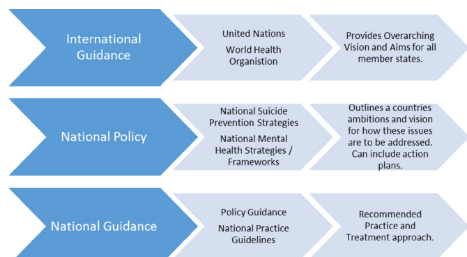
Figure 2 Policy categories.

directly related to CYP (youth) 66 and has moved towards a much more generic approach. 45