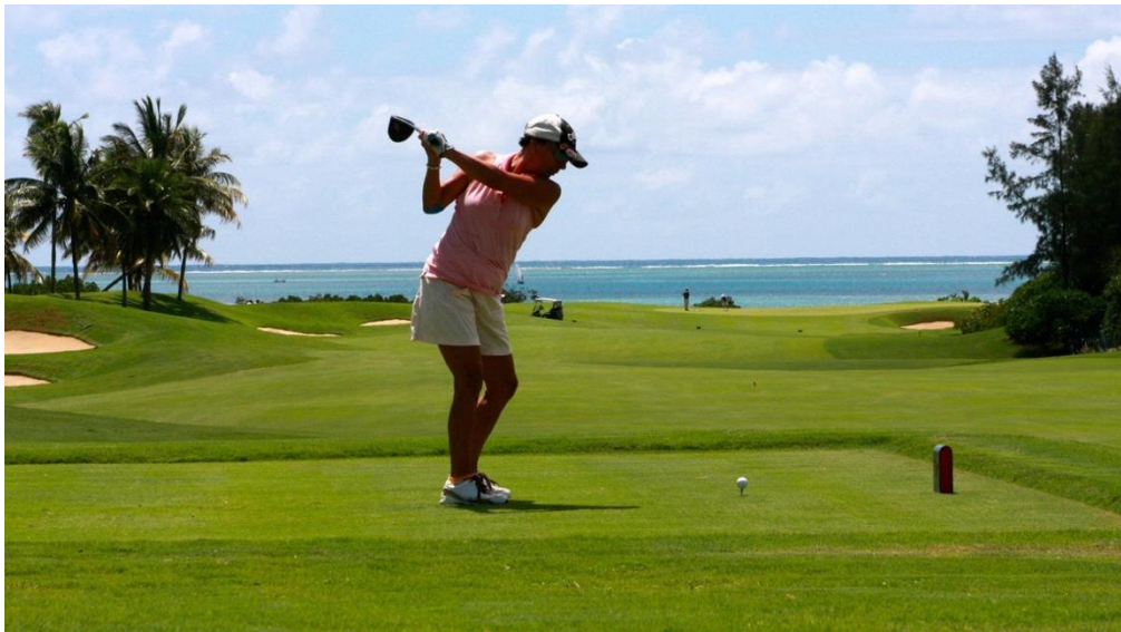
Figure 8.1 Attributions matter

Bernard Weiner (1985) proposed that human behaviour can be motivated by the way individuals explain the causes of events or behavioural outcomes. Take, for example, the case of a golfer, Cathy, who fails to make the cut in a major tournament (see Figure 8.1). Weiner's (1985, 2012, 2018) attribution theory suggests that the way she explains this outcome to herself will have consequences not only for her well-being but also for her future behaviour — such as, her motivation to come back and try to make the cut in the next tournament. In particular, the theory predicts that she is going to be more motivated to do this if she convinces herself that she adopted the wrong strategy, did not practice enough or that she was simply unlucky this time, than if she believes her failure is a sign that she just doesn't have what it takes to succeed.