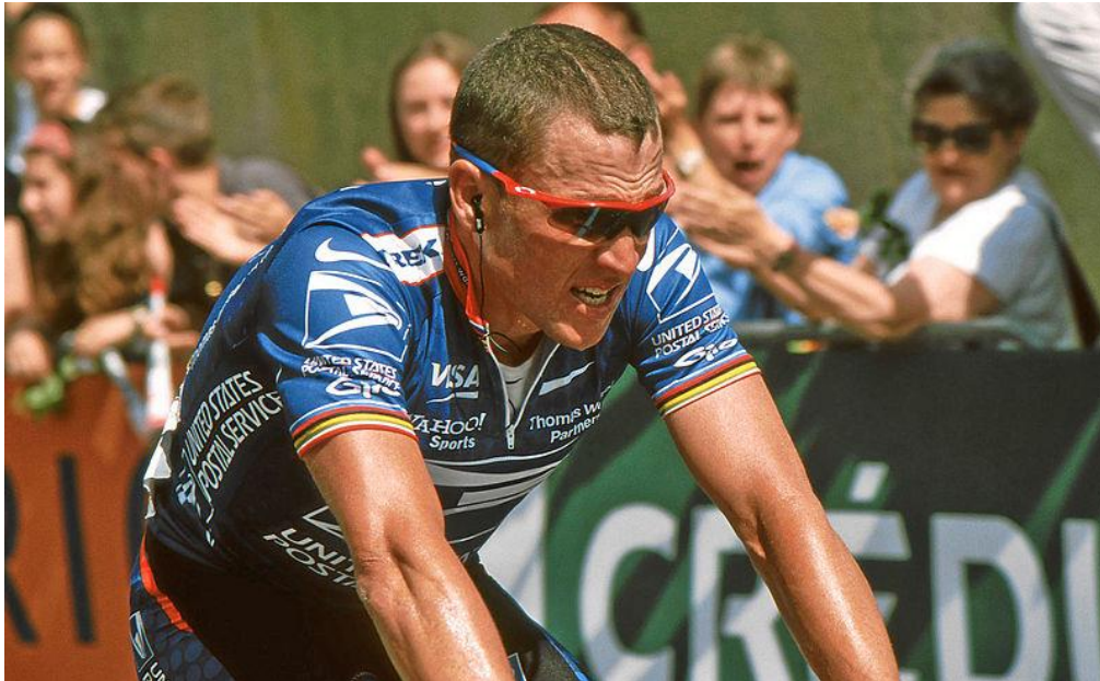
Figure 8.5 Group-serving bias amongst fans

Note: When an athlete — such as Lance Armstrong, pictured here — has been found guilty of illegal or illegitimate sporting behaviour, their supporters will often display group-serving bias in their explanations of the infringement. For example, they may downplay the significance of the behaviour (i.e., attributing it to non-dispositional factors) and/or suggest that it was more a consequence of the environment (i.e., attributing it to situational factors). They will also often display the same reason, belief, and marker asymmetries as the athlete themselves.