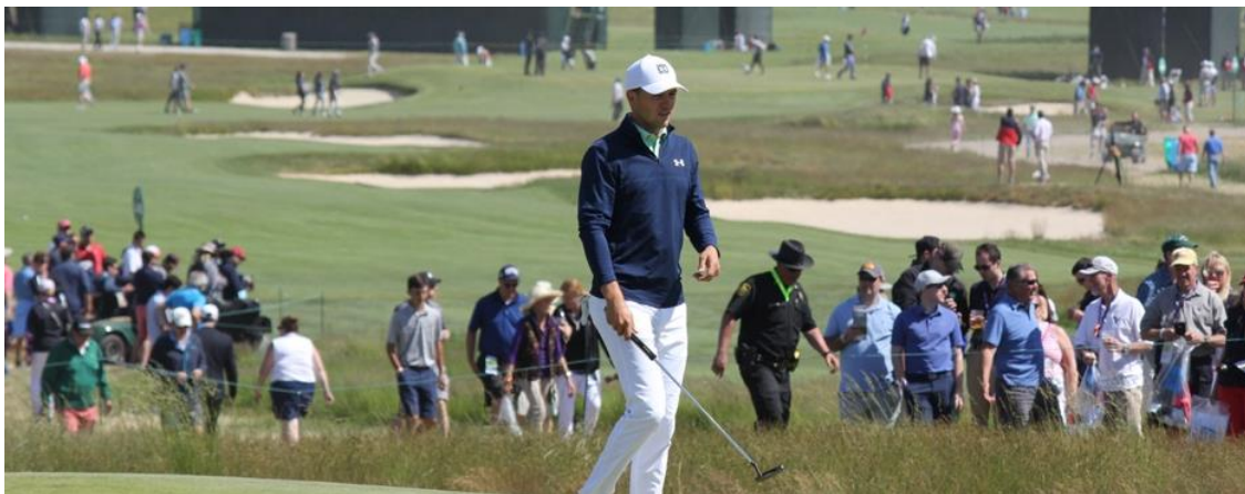
Figure 8.4 Team-referent attributions