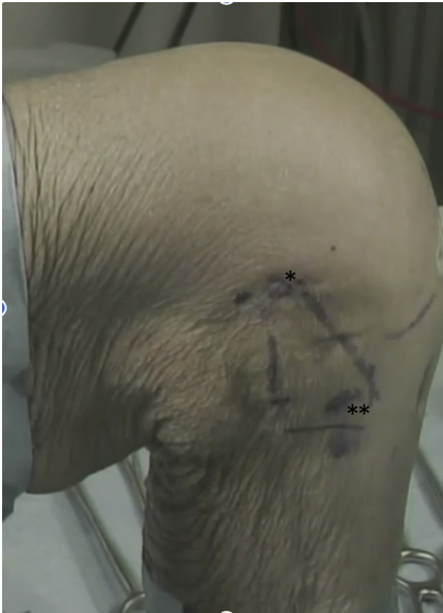
Fig 1. Medial view of left knee. The medial epicondyle (1 asterisk) and the distal insertion site of the medial collateral ligament, roughly halfway between the joint line and the pes anserinus (2 asterisks), are shown.

flush with the cortex to minimize any subcutaneous irritation and to ensure optimal strength of the fixation itself (Fig 2). The FiberTape is an ultrahigh-strength 2-mm-wide tape, consisting of long-chain ultrahigh-molecular-weight polyethylene.