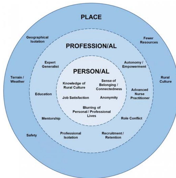
Figure 2: MacKay's 3P model of factors influencing rural and remote nurses' decision making.