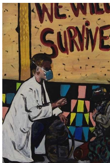
Figure 1. Painting 1 showing services changing to being provided on the streets.

The painting below (Figure 1) depicts the COVID-19-related changes to substance use/homelessness services and, in particular, the increase in outreach services.