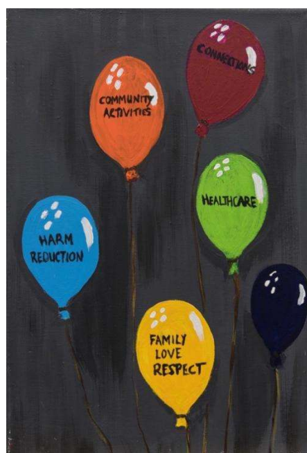
Figure 3. Painting 3 showing features of MAPs.

With growing awareness of the need for better harm reduction relative to alcohol, some participants spoke about how the pandemic presented an opportunity for MAPs to be implemented as part of national and city-wide responses. This was highlighted as something that would differ markedly from what existed pre-COVID, where alcohol services were described as “quite linear, quite regimented” (Manager 7). Some participants spoke about how the fear of COVID-19 had “brought a sense of urgency to the table that wasn’t there before. If we think it will save lives, we are going to give it a go.” (Stakeholder 5).