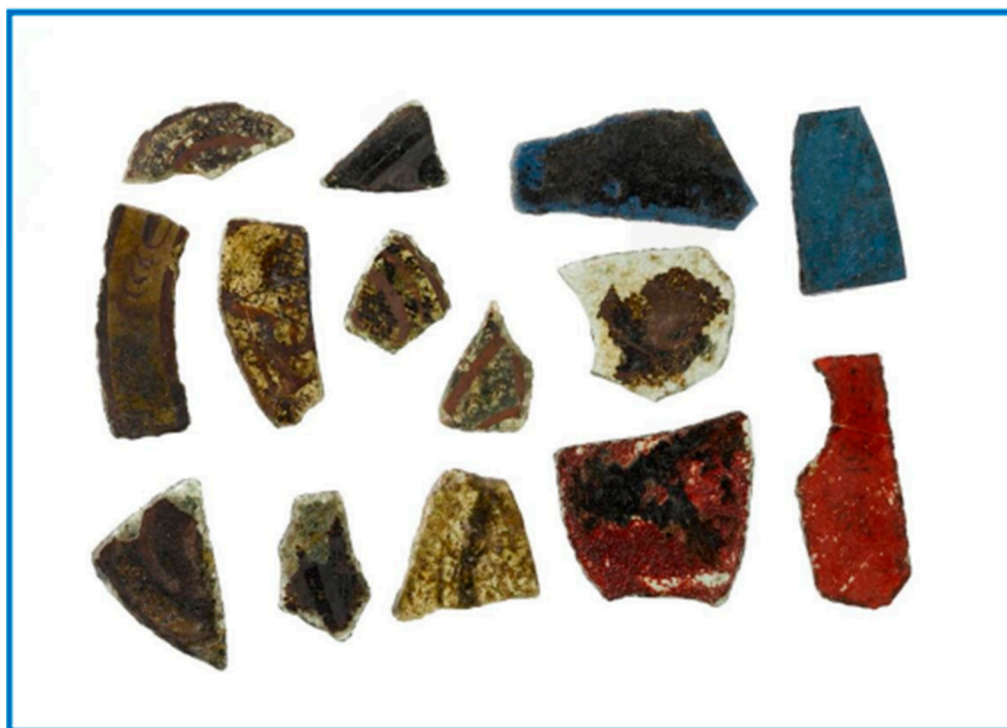
Figure 2. Glass fragments recovered from Dunfermline Abbey, gifted to the Society of Antiquaries of Scotland from c.1818 and now in the National Museum of Scotland, Edinburgh [Cat. H.KJ 3].

Antiquarian drawings of the late 18th century indicate this northern-choir Lady Chapel had five bays of Gothic windows with four tall panel lights each (gabled by a matching window to the east and west) and peaked with a tier of six window roundels [38]. These may have depicted the miracles and life story of the Virgin, focussed around her six major feasts, or perhaps even the genealogy of the abbey's royal patrons. But they might also have incorporated images of further saints, particularly females, with cartulary and burgh record evidence for altars to the Virgin, Anne, St Margaret of Scotland's head shrine, Katherine of Sienna, Katherine of Alexandria, Margaret of Antioch, Mary Magdalene, Ursula and Aebbe of Coldingham founded over time [7].