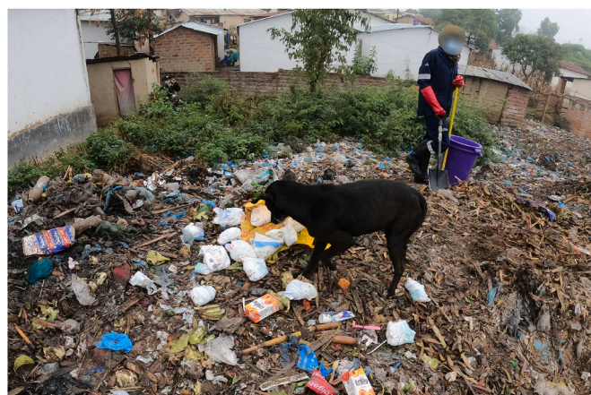
Fig. 1. Stray dog rummaging through disposable diaper waste on an open dump site in Ndirande, Blantyre, Malawi.

To date, there has been minimal research into understanding the trends in, and challenges behind, the use of disposable diapers in LMICs. Given the increasing global usage of disposable diapers and their potential to act as a reservoir for pathogenic microorganisms, there is a pressing need to raise awareness of the problems associated with diapers in the environment. Here, we critically discuss the challenges associated with the use of disposable diapers in LMICs, drawing particular attention to common disposal practices employed by caregivers, and the resultant impacts on environmental and human health.