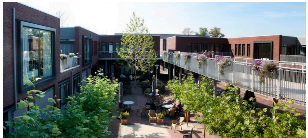
Figure 6. Courtyard and outdoor seating of De Hogeweyk, The Netherlands (adapted from WAR 2020 [113]).

Each household is configured around courtyard spaces, and each of them has distinctive features to form key landmarks for wayfinding and orientation. All households are accessible to outdoor spaces to maintain a connection with external environments (Figure 6). Generous outdoor spaces with gardens, water features, alleyways, and streets allow residents to wander and explore in a stimulating manner [83]. The objective is to maximise residents' autonomy, encourage social interactions, and foster community engagement [112].