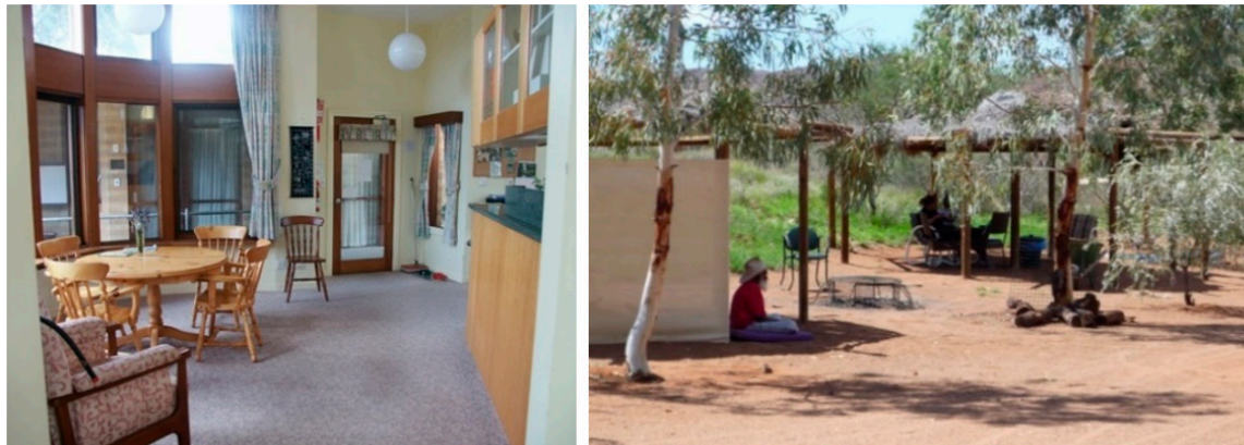
Figure 2. Homelike environments in different settings, adapted from the WAR Volume 2 ((left), [59] and (right) [60]).

Figure 2 shows how the schema can work in practice. Here are two examples of places to sit: one inside (left [59]) and one outside (right [60]). In both cases, the goal is to provide equality in opportunity, dignity, autonomy, choice, and independence. One of the principles that needs to be applied to achieve these goals is to ‘Create a familiar place’. An approach that responds to this principle is to create a homelike environment. In this example, it is the design responses that are very different, as they consider people’s specific contexts and cultures. As a result, in one setting, people sit indoors at a table or in an easy chair looking out of the window, whilst in another setting, people sit outdoors on ground with good sand located under a structure with shade.