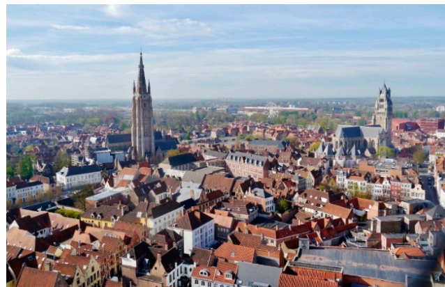
Figure 3. Bruges, Belgium (adapted from [88]).

Various initiatives have been implemented in Bruges under the coordination of Foton. More than 90 shops display a logo of a knotted red handkerchief to signify that the staff have a high level of awareness about dementia and can provide compassionate assistance to those in need [86]. The Foton choir, composed of members living with dementia, has been actively participating at the Bruges' Music for Life Festival through live performances. A database has been set up to identify residents who are prone to wandering and to provide necessary assistance with wayfinding and navigation for those in need [87].