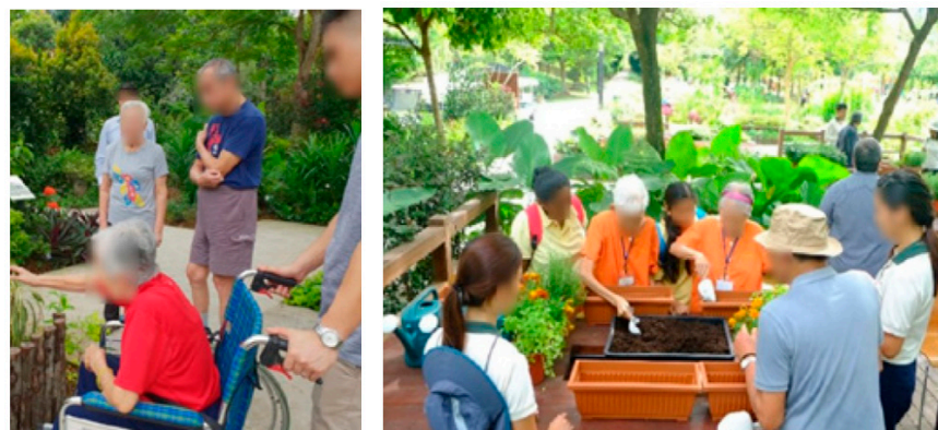
Figure 4. Therapeutic garden at HortPark, Singapore (adapted from WAR 2020 [92]).

The activity zone has exercise equipment and provides space for conducting therapeutic programmes and horticultural activities (Figure 4). Moveable and raised planter beds with easily accessible water sources facilitate wheelchair users and people living with dementia to participate in typical garden tasks, such as watering, weeding, and harvesting [91].