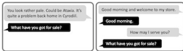
Figure 4: Two dialogues from Schlünder & Klabunde (2013). Click image to enlarge.

Trope-informed design would suggest tying the player's behaviour to the relationship they have with the NPC. We don't expect the player to have a relationship with the merchant, so a ritualised greeting makes sense here. If the player character had a different kind of relationship with the NPC, we might expect a different kind of greeting. The NPC might become uncooperative if the player does not greet them, violates the formula or is vague too often. This would allow the mechanics of conversation to be used to establish themes in the game. For example, respect and affiliation with poor peasants who you are sworn to protect; traditional, polite culture versus modern, brash attitudes; or a sinister culture of surveillance and gossip where anyone might be labelled a traitor. One way to make that clear to the player is to give them options between several "registers" of greeting or skipping the ritual. The NPCs can then show some indication of offence if the "polite" ritual is not followed (e.g., refusal to help, vagueness rather than specific information).