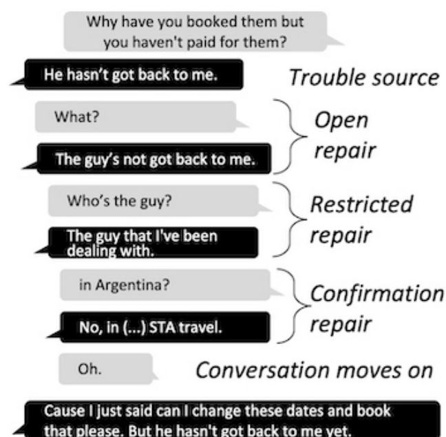
Figure 1: An example of an extended repair sequence, based on Rossi Corpus of English, RCE08 20000a-c (Rossi & Kendrick, 2013). Click image to enlarge.

In real conversations it is often the case that people do not understand or simply do not hear each other. To help us deal with this, we have systems of "repair" that get the conversation back on track (Schegloff, Jefferson & Sacks, 1977; Dingemanse et al., 2015; Micklos, Walker & Fay, 2020). These systems are quite predictable. For example, in Figure 1 below, A and B are discussing the booking of holiday tickets: