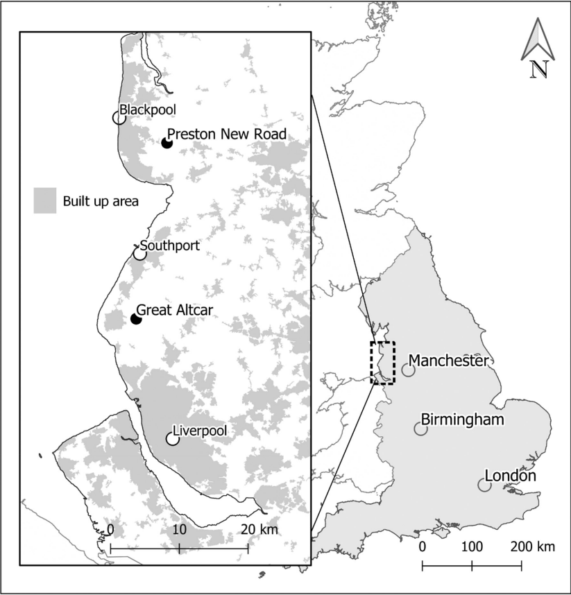
Figure 1. Map of Great Altcar.

About 80 percent of energy used to meet global demand is generated through the extraction of fossil fuels from the subsurface (Ritche, Roser, and Rosado 2022), a practice typical across rural landscapes. As efforts grow to decarbonize energy systems and achieve net-zero, proposed solutions such as geothermal energy and storage, as well as carbon capture and storage also depend on underground interventions for implementation, (Stephenson et al. 2022) and are crucial for supporting uninterrupted energy supplies (van Gessel et al. 2021). Essentially, underground interventions have been