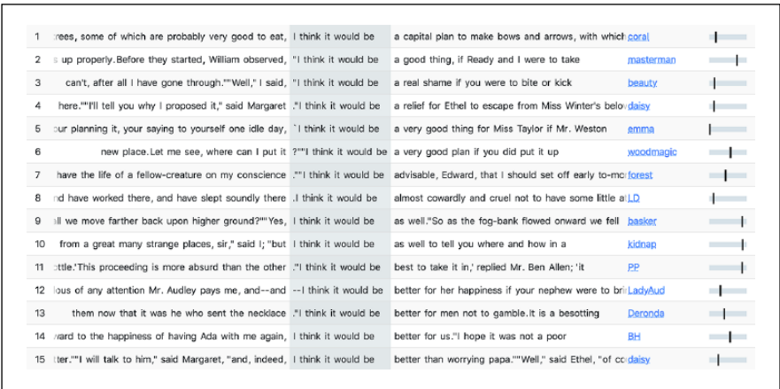
Figure 3. Fifteen of the 39 concordance lines of I think it would be in quotes in DNov, I9C and ChiLit, sorted on the right (one additional concordance line occurs in non-quotes in the first-person narration of Bleak House ), retrieved with CLiC 1.7. Note: In the current version of CLiC 2.0.2, two instances are found in non-quotes (and only 38 in quotes), because one instance is mistagged in ChiLit due to a different tagging algorithm.