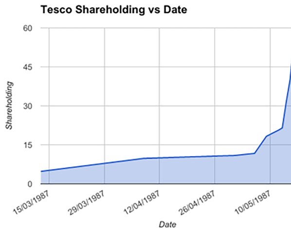
Figure 3. Acquisition of Hillards' Shares by Tesco (data sourced from the Financial Times ).

The share price of Hillards went from 178p in early February to an eventual take-over price of 465p. This is a marked difference, and a significant premium for the shareholders. From the point of view of the shareholders this would reflect a good price for what would appear to be a highly regarded regional chain. The public campaign must have contributed to this increase in share price, in effect extracting a maximal (or near maximal) price from Tesco to acquire the firm. Though Hillards disappeared, the shareholders did well.