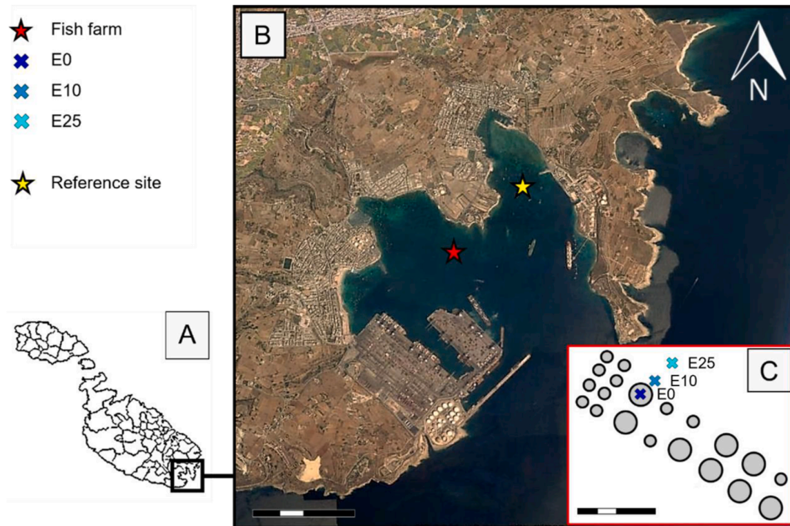
Fig. 1. A. Location of the study area, Marsaxlokk Bay, in southeast Malta. B. Locations of the fish farm, represented by the red marker, and the reference site, represented by the yellow marker, in Google Earth (Scale bar: 1 km). C. Sea cucumber cage positions at the experimental sites (E0, E10 and E25) near a gilthead sea bream fish cage as part of an integrated multi-trophic aquaculture system (Scale bar: 100 m).

procedure was tested using the CRM recovery, which ranged from 88 % to 98 % at significance level of 0.05.