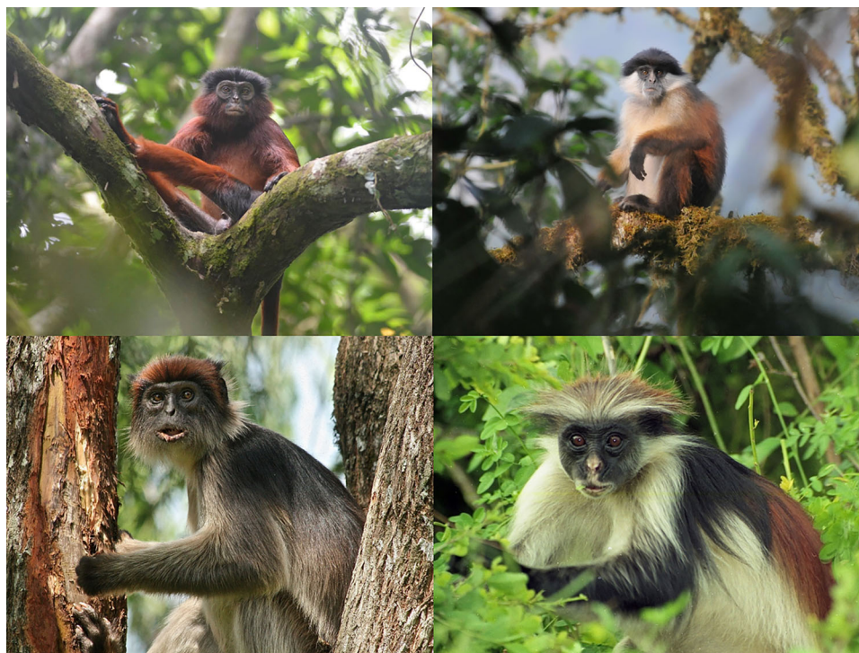
FIGURE 2 Examples of red colobus from west, central, and east Africa. From left to right, top: P. badius badius in Côte d'Ivoire, P. pennantii on Bioko Island, Equatorial Guinea; and bottom: P. tephrosceles in Uganda, and P. kirkii on Unguja Island, Zanzibar, Tanzania.