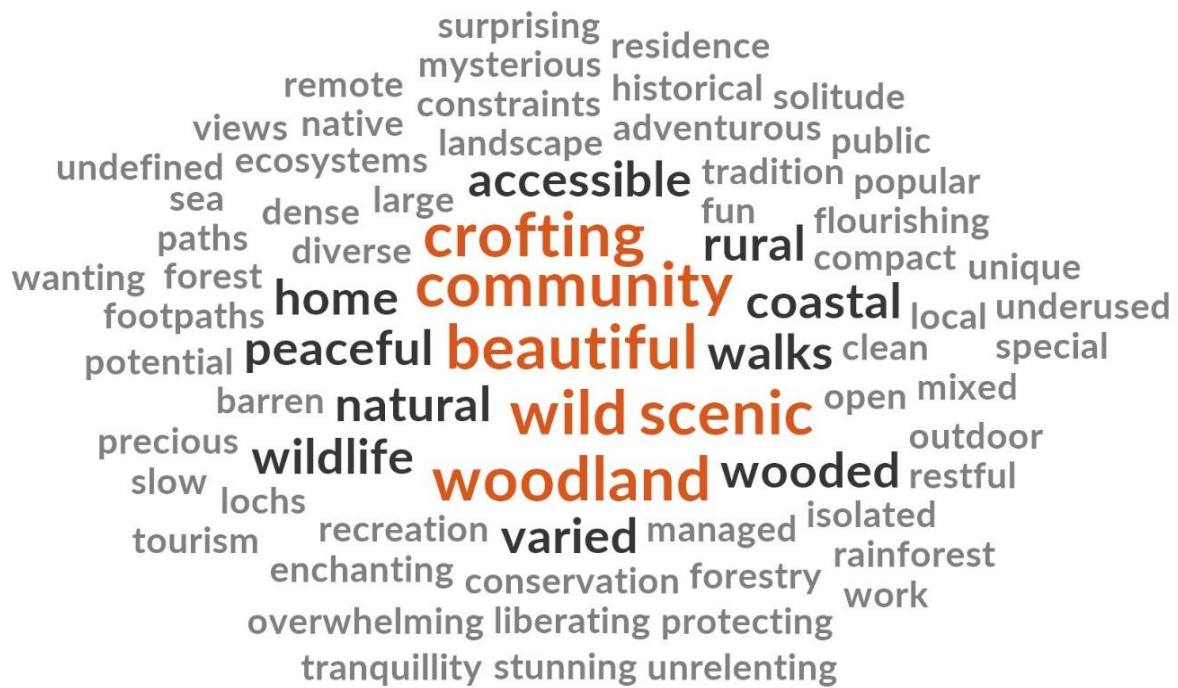
Figure 1: Responses from online questionnaires and in-person structured interviews when participants were asked for 3-5 words that described Balmacara Estate (word cloud of stemmed words, produced in NVivo 14).

Many of the values identified in these key findings and discussed in more detail in later sections of this report (see Findings: Social Values) are reflected in the word cloud below (Figure 1), which is based on the key words participants used to describe the Estate. Crofting, community, woodland and coast are some of the most prominent themes, and these are linked to beautiful and scenic. Peace, nature, home, walks, accessible and varied also resonate strongly with the key findings.