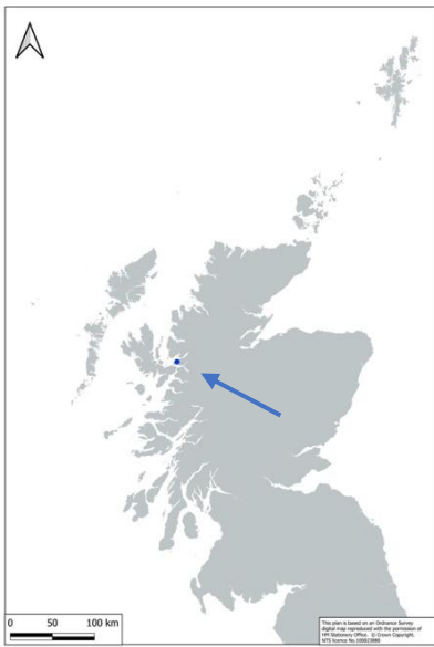
Map 1: Property location (blue dot). Not to be reproduced without permission.