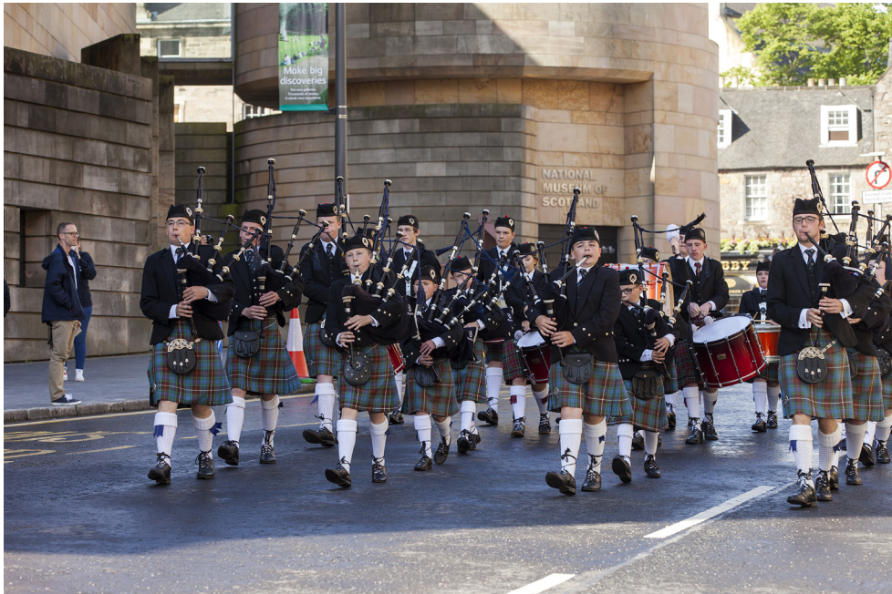
Figure 1. Pipers on Chambers Street herald the opening of the new galleries in the National Museum of Scotland, 8 July 2016. Copyright Ruth Armstrong Photography. National Museums Scotland.

Key words: contemporary collecting, National Museum of Scotland, project management, reflective practice