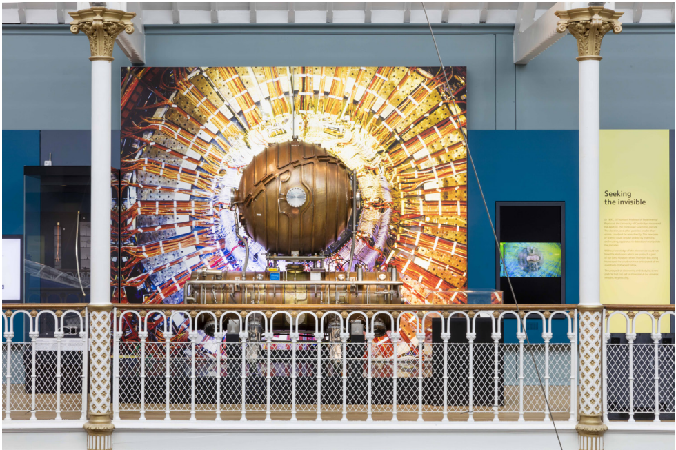
Figure 6. The Large Electron-Positron Collider accelerating cavity from CERN in Enquire (T.2014.34). National Museums Scotland.

By way of conclusion, we offer some lessons learned about three particular relationships that contemporary collecting runs through: between science and art; between structure and flexibility; and between project management and (other) museum managements.