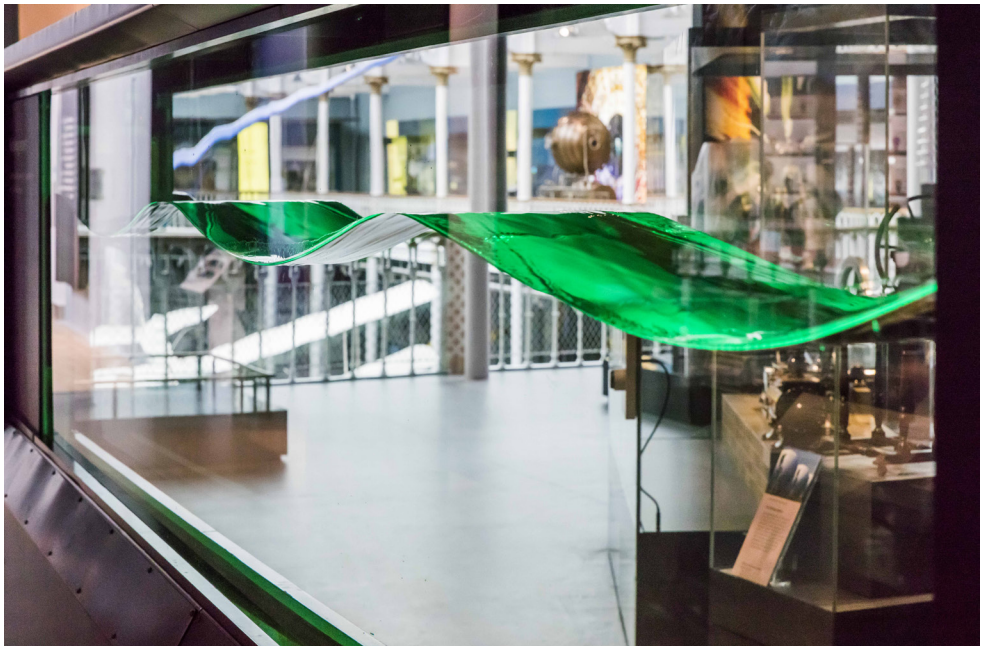
Figure 5. The bespoke commissioned interactive wave tank in the Energise gallery. National Museums Scotland.

One new object illustrates the way of working that brought this material to the Museum. Elsa Cox, lead curator on Energise , wanted to bring in recent material to enhance the already strong energy collections, to realize the contemporary objectives of the project and to play on a politically relevant issue. The department had an existing relationship with the University of Edinburgh, where engineer Stephen Salter and colleagues had pioneered marine renewable energy since the 1970s (Salter 1974). The famous wave energy converter 'Salter's Duck' was already on display in the existing gallery next door, Scotland: A Changing Nation , and this was transferred to Energise . This introduced the time-consuming problem of back-filling an existing display, a workflow that is not always accounted for in project planning, and in this case, was a lesson learned.