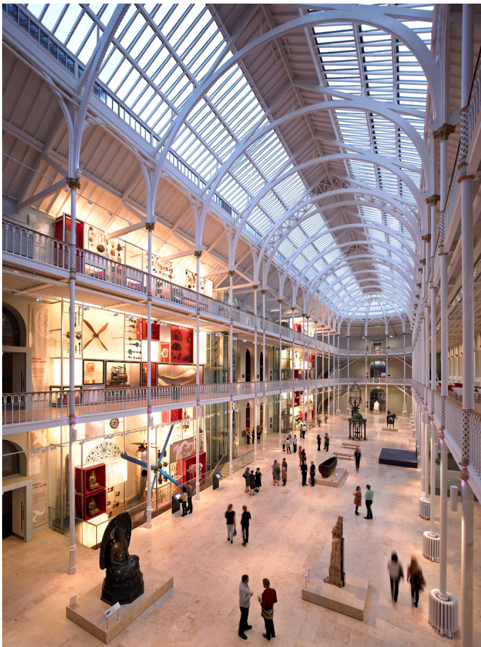
Figure 2. The central atrium of the National Museum of Scotland's Victorian building showing the 'Window on the World' display, redisplayed in 2011.

Like similar capital projects in the UK at this time, early project activity focussed on an application to the Heritage Lottery Fund (HLF); round one was submitted in April 2012. This eventually secured a £4.85M grant, the nucleus of the £14.1M project cost. HLF requirements stipulated the audience-driven approach we were in any case taking: we identified target audiences, preparing a detailed activity plan laying out how we would engage and