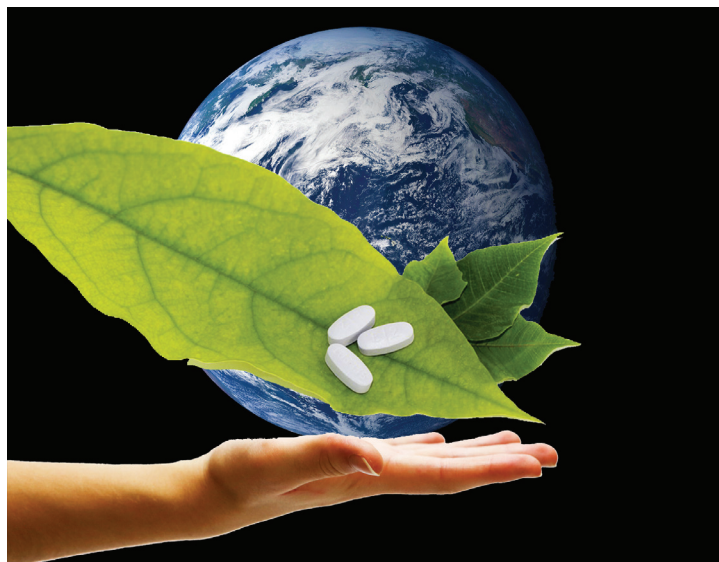
Photo: Illustration created by Milica Pešić using CC0 Creative Commons images (no attribution required).

Sound ethical oversight and responsible policy implementation needs to accompany exploration of medicinal species, whether bacteria, fungi, plants or