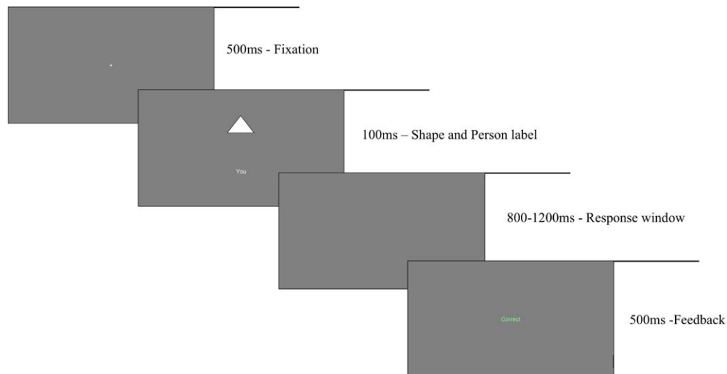
Figure 1. Example of a (correct) trial in the Shapes Task.

Given the importance of this issue, we investigated it in the current study using one of the “new wave” methodologies that have moved the field on from investigating the effect of self-reference on memory. Here, we employed the Sui et al. [2012] Shapes Task to investigate for the first time the influence of self-representation on perceptual binding . In Experiment 1, we adopted an individual differences approach to establish whether the size of the self-bias on the Shapes Task (i.e., the extent of the accuracy and RT advantage for self-related matches over other-related matches) was associated with the number of ASD traits [as measured using the Autism-spectrum Quotient; Baron-Cohen, Wheelwright, Hill, Raste, & Plumb, 2001] reported by 124 neurotypical individuals.