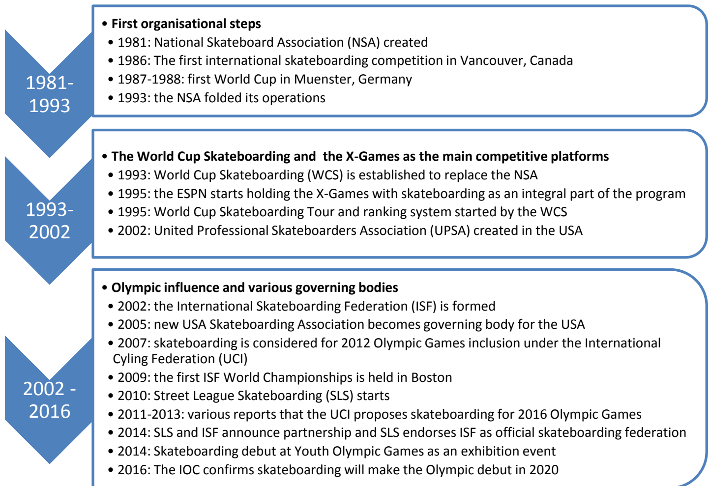
Figure 1: Timeline of organisation of international competitive skateboarding