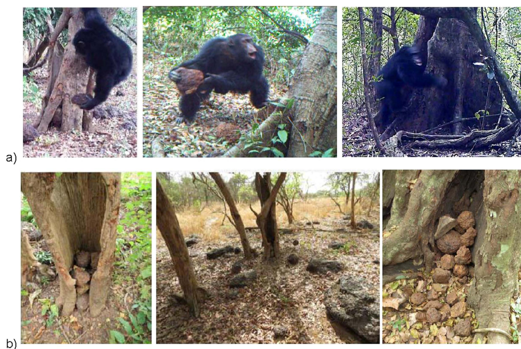
Figure 2. Photographs and stills of accumulative stone throwing behaviour and sites. (a) Adult male chimpanzee tossing a stone; hurling a stone (Boé, Guinea-Bissau); and banging a stone (Comoé GEPRENAF, Côte d'Ivoire). (b) Boé, Guinea-Bissau landscape: stones accumulated in a hollow tree; a chimpanzee accumulative stone throwing site; and stones accumulated in-between buttress roots (see also Supplementary Movies 1–7).

Chimpanzee accumulative stone throwing behaviour. Thirty-one TRSS located within the Pan troglodytes range were sampled between 2011 and 2015 for a period of 14–17 months. An additional three TRSS were on-going and studied for less than 14 months, for a total of 34 (see Supplementary Table 1). At four TRSS: (Boé,