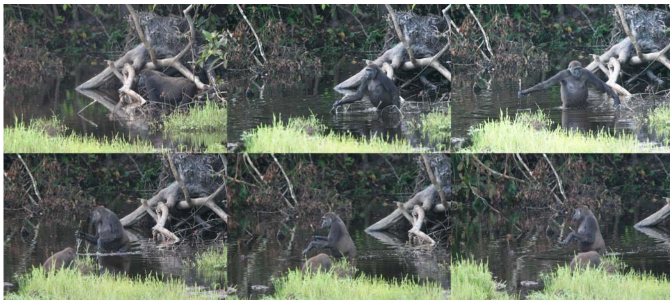
Figure 1. Female Leah Using a Walking Stick while Crossing Bipedally through an Elephant Pool at Mbeli Bai

Female Leah first looked at the new elephant pool and the branch she later used as the walking stick, and entered the water without the tool (not shown). After re-entering the pool and taking the branch with her right hand, she walked bipedally 8–10 m into the water, frequently testing water deepness.