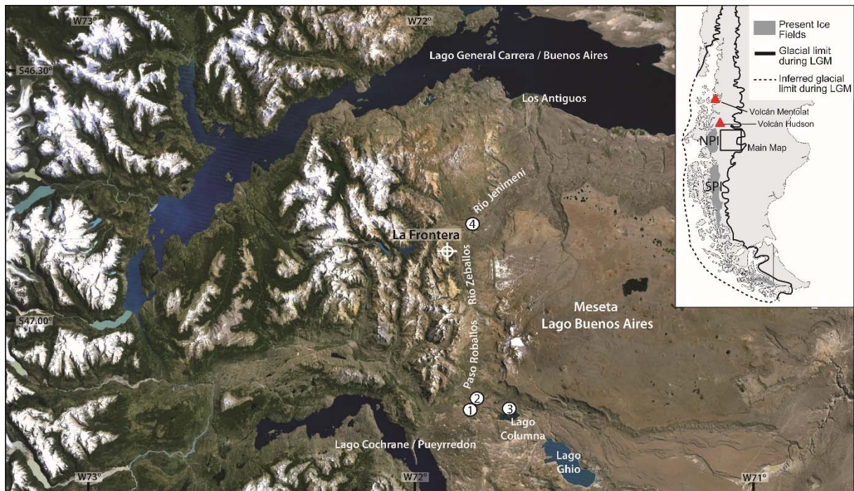
Figure 1. Study area and places indicated in the text. The inset map indicates the location of the study area within Patagonia. Archaeological sites indicated (1) Sol de Mayo I, (2) Colmillo Sur I, (3) Lago Columna I and (4) Alero Mauricio II.

landscape, climatic conditions and the potential resources offered to the hunter-gatherers during the periods of occupation.