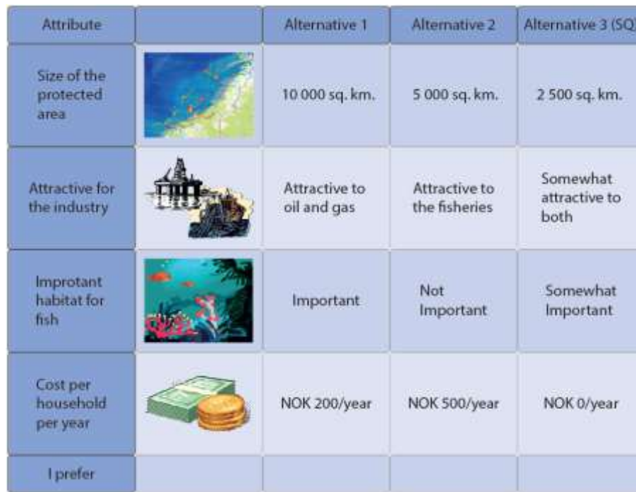
Figure 1 - Sample Choice Card (Translated into English)

this paper, we use a respondent's score on the quiz as a measure of their knowledge of the environmental good. Following this, and before filling in their choice cards, respondents received a second 5-minute presentation, this time focused on explaining the discrete choice experiment they would be faced with, including the attributes and levels. This presentation gave equal weight to each attribute and corresponded with the information provided in the first presentation.