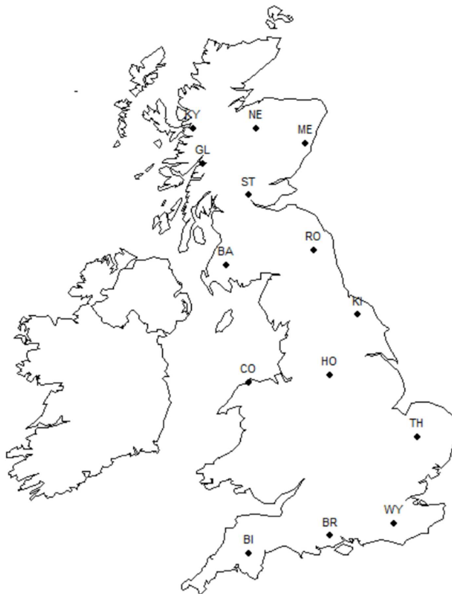
Fig 1. Map of collection sites for lucorum complex individuals.