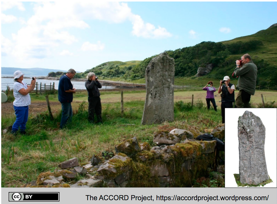
FIGURE 1 Members of the Ardnamurchan Community Archaeology Group and the ACCORD project team engaged in photogrammetric recording of Camas Nan Geall early mediaeval cross-incised standing stone. A visualization of the finished model is in the bottom right.