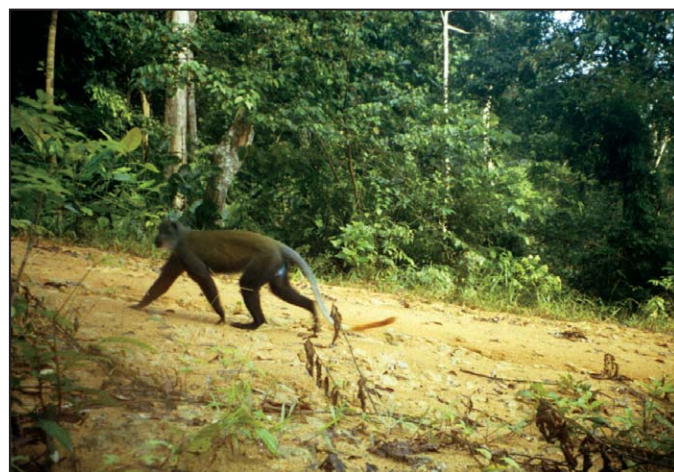
Figure 4. Cercopithecus solatus photo taken using camera trapping, close to Mount Mimongo.

Fifteen camera traps were deployed in a 30-km 2 study area over 54 days between 28 August and 21 October 2004 in an area about 10 km to the south of the southern bank of the Lolo River. No images of C. solatus were obtained. This indicates that the species is either absent or very rare south of the Lolo River. Lauren Coad and local field assistants conducted a hunting study from January 2004 to January 2005 in the same area in two villages, Dibouka (01°19'07"S, 12°12'54"E) and Kouagna (01°18'28"S, 12°13'45"E). Their results showed considerable hunting pressure that was highest within 5 km from the villages, but also extended up to hunting camps 12 km to the north, on the southern bank of the Lolo. During this study all hunting returns for the two villages were recorded, and no C. solatus were ever caught or seen. During a previous hunting study in these villages conducted by Malcolm Starkey from 2000 to 2002, no C. solatus were