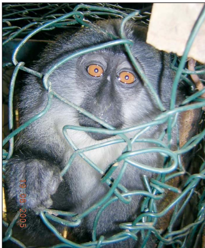
Figure 3. Young female Cercopithecus solatus captured in the buffer zone of Mount Birougou National Park, southern Gabon, in June 2005.

villagers brought him a juvenile female in early June 2005 (Fig. 3). It had been caught in a ground snare in the northeastern buffer area of Mount Birougou National Park, in a hilly area (altitude 600 m). In the early afternoon of 8 March 2004, Tanga observed a single adult resting on a tree branch at the forest edge along the road between Popa and Mbigou Moréné (01°31'12"S, 12°17'24"E; altitude 355 m; Lolo-Bouenguidi Department, Ogooué-Lolo Province).