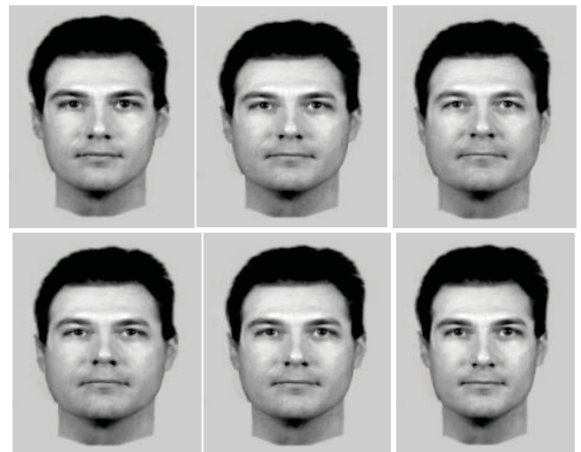
Fig. 4. An example of the ageing (top row) and pleasantness (bottom row) holistic scales. Manipulations increase in magnitude from left-to-right and are illustrated on an EvoFIT of TV celebrity, Simon Cowell.

Following development of these age-constrained databases, users still sometimes evolved faces with inaccurate ages, though to a lesser extent than before. We sought to overcome the problem by providing a sliding scale for adjusting composites' perceived age, and extended this facility to allow adjustment of other whole-face properties. These so-called holistic tools included face weight, masculinity, threatening, attractiveness, honesty and extroversion. See Fig. 4 for examples, and Frowd, Bruce, McIntyre, Ross and Hancock (2006a) for a description of how the scales were designed. Further scales were developed to add stubble, eye-bags and deep-set eyes, and to alter the greyscale levels of brows, irises, mouth creases, etc. These holistic tools are used at the end of evolving, after external feature blurring is turned off.