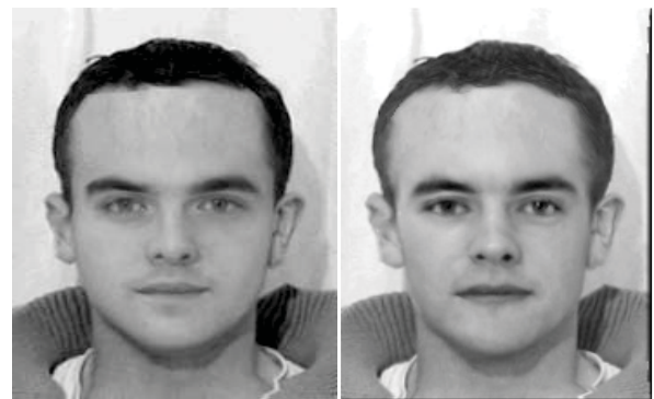
Fig. 2. EvoFIT Images produced of TV presenter, Anthony (Ant) McPartlin. The same person used the system twice to evolve a composite of his face from memory, producing a consistent likeness.

An evaluation of this version of the software was carried out. Fifty laboratory-witnesses saw a photograph of a footballer whose face was unfamiliar to them, and two days later described the face (using a CI) and constructed a composite with EvoFIT or a traditional feature system. The resulting images were then given to football fans to name. Among witnesses who attempted to remember the face in detail, EvoFITs were correctly named at 11% and feature composites at 4% (Frowd et al., 2007b). In subsequent research (Frowd, Bruce, Plenderleith & Hancock, 2006b), we asked the same person to use the system more than once to construct a likeness of the same target face. There was good consistency of results, as Fig. 2 illustrates. When used in this way, the faces the user sees at the start change for each attempt—they are different random faces—and so the search process is also somewhat different each time, as is the resulting image.