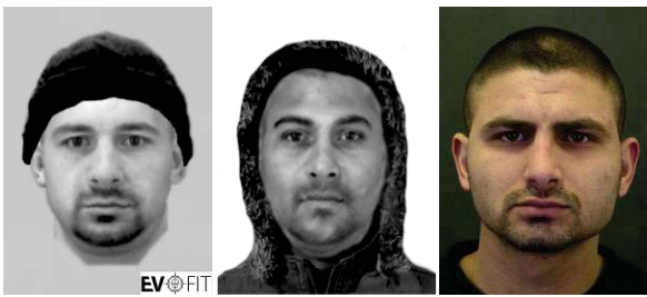
Fig. 9. The EvoFITs (left and centre) of an offender were constructed by separate victims. On the right is a photograph of the person believed to be responsible for two robberies.

Deception: A further noteworthy case involved a person who reported being robbed of a large sum of money. An EvoFIT was constructed as normal. As the session was nearing the end of completion, however, the complainant appeared to become rather agitated. It turned out that the 'victim' had both described and attempted to construct a composite of himself! He retracted the allegation of robbery.