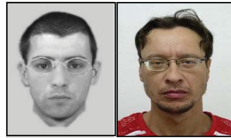
Fig. 7. The left image is an EvoFIT produced by a 10 year old victim of robbery; the right image is a recent photograph of the person convicted.

Mobile phone thefts: Between May and August 2009, a series of very similar crimes was committed against minors, particularly against those aged 12 years and under. The offender in this investigation chose buildings with an elevator, to enable him to follow his victims into the elevator. Between floors, he stopped the lift and, under threat of violence, stole the young person's mobile phone. One of the victims, a 10-year-old girl, was interviewed to construct a composite of the offender. She could not describe the robber's facial features—a problem arising for many victims—but was able to produce an EvoFIT. The 23 to 35 year Eastern European male database was used; the resulting image is shown in Fig. 7.