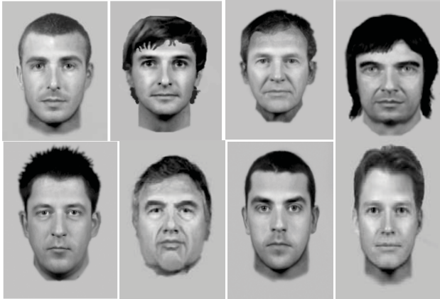
Fig. 5. EvoFITs made from memory. From left to right (top row), they are of footballer, David Beckham; actor, David Tennant; former US president, George W. Bush; singer, Noel Gallagher; and (bottom row) footballer, John Terry; singer, UK politician, Gordon Brown; singer, Robbie Williams; and UK politician, Nick Clegg.

Example celebrity EvoFITs constructed from memory using this version of EvoFIT are illustrated in Fig. 5.