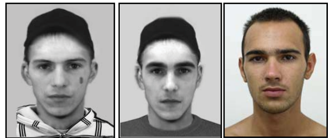
Fig. 8. These EvoFITs (left and centre) of a bicycle thief were constructed by separate witnesses over a period of two months. On the right is a photograph of the person believed to be responsible for committing these crimes.

Shimano bike thief: EvoFIT also proved valuable for detecting a fairly-prolific bike thief. This involved four thefts of bicycles between May and August 2009, with the thief cutting safety locks. Two EvoFITs were constructed by eyewitnesses at Iasi Police Headquarters, leading to the arrest of the person shown in Fig. 8.