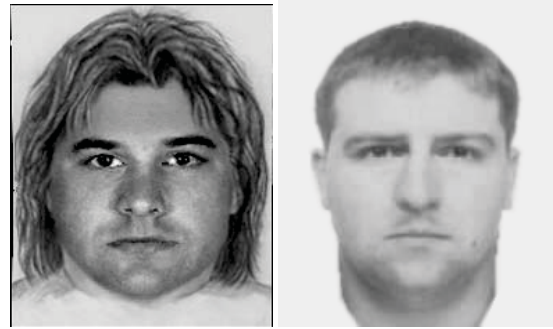
Fig. 1. The EvoFIT (left) and person (right) convicted in the 'Beast of Bozeat' case. Shortly after the crime, the perpetrator is believed to have changed his hairstyle in an attempt to conceal identity, as illustrated here.

together in combination (each possible facial shape shown with each possible facial texture) for identifying the best likeness.