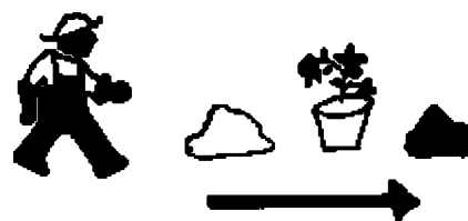
Figure 2. Schematic diagram representing the ego-moving system of spatial perspective.

interacting with the environment play a key role in directing specific cognitive facilities.