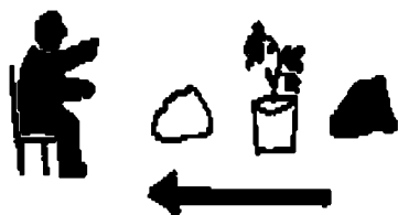
Figure 1. Schematic diagram representing the object-moving system of spatial perspective.

In the present study, we investigated how ambiguous spatial terms are understood, focusing specifically on the role of experience. Some researchers have suggested that language—in particular, abstract or ambiguous words—is grounded in daily embodied experiences (Lakoff & Johnson, 1999). This is consistent with research on embodied cognition, an area that highlights the influential role the environment plays in the development of cognitive structures (e.g., Barsalou, 1999; Glenberg, 1997). Although there are various extensions of this view, a common theme is that the sensorimotor capacities of an individual who is