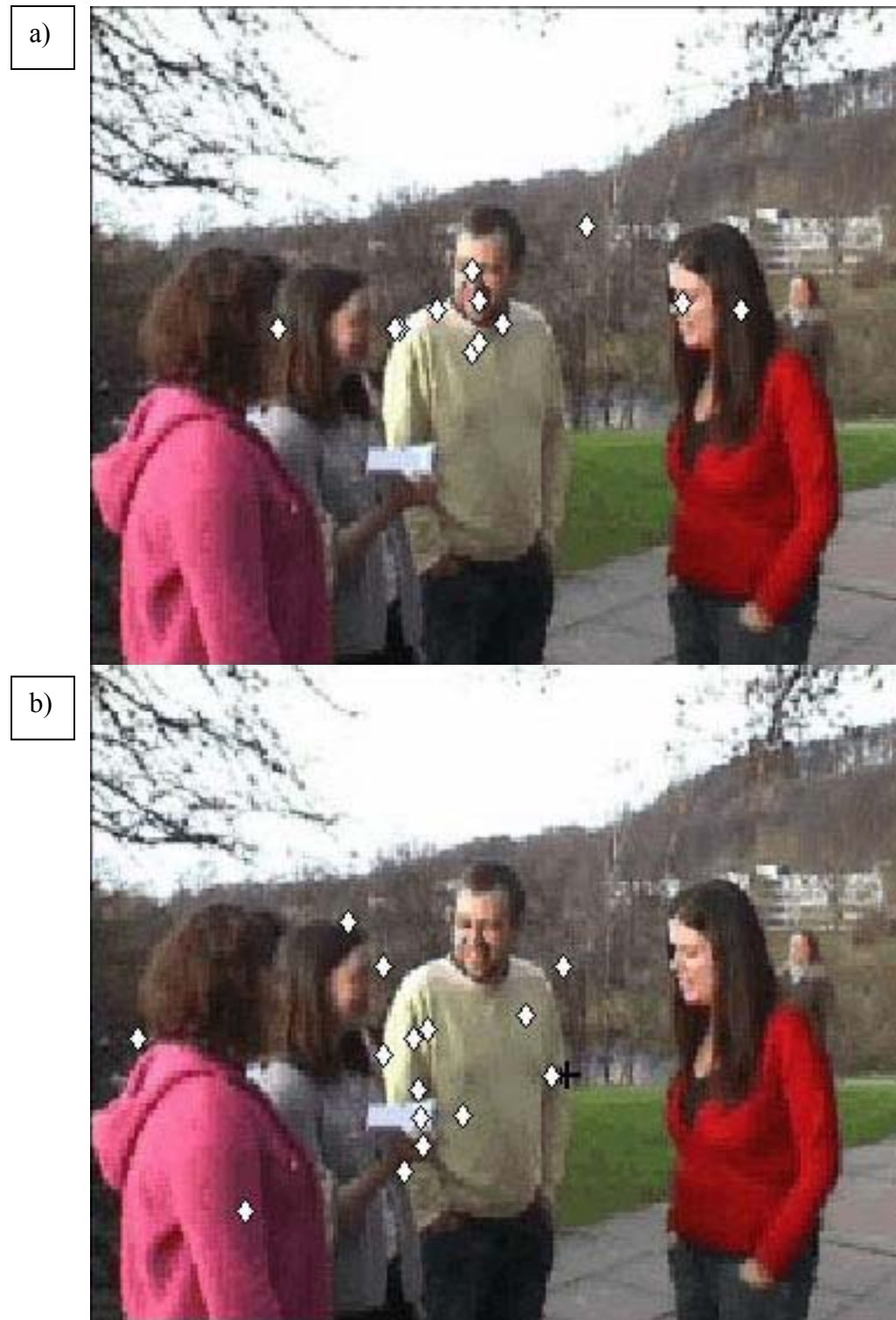
Figure 2: Example differences of visual fixation points for a) individuals with WS and b) autism towards one frame of a movie showing human actors.