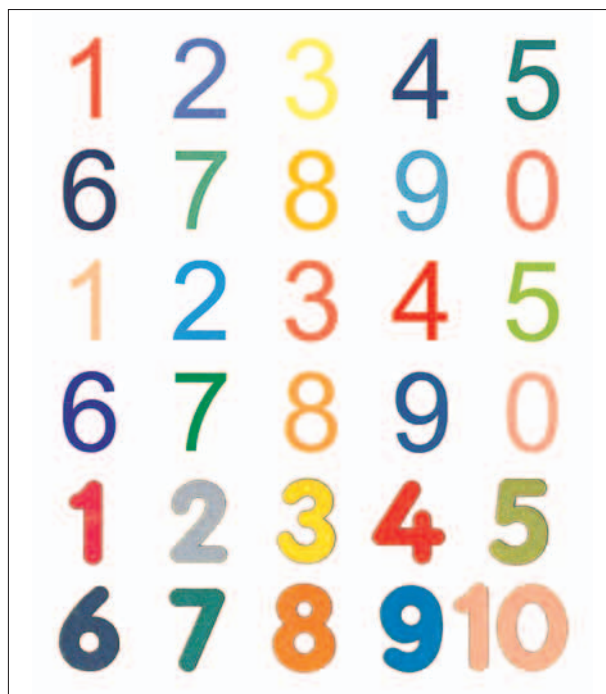
Fig. 1 – The congruent colours chosen by R (top) and T (middle), with a reproduction of the colours used in the jigsaw (bottom).

Of the 480 trials, 49 (10.2%) were removed for R and 51 (11.25%) for T because the voice trigger either failed to detect the word, or was observed to be triggered by some extraneous noise such as a tongue click. A further 38 (R) and 19 (T) were removed because of being more than two standard deviations from the mean 1 . Mean reaction times for answers to congruent and incongruently coloured