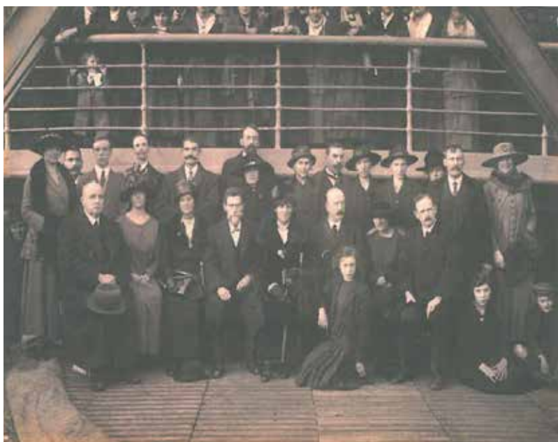
Departure of first contingent of Scottish Belgian Refugees to Belgium on SS Khyber from Hull, 16 December 1918

in England and Wales, while in Ireland these arrangements were conducted by the Irish LGB. However, the Scottish LGB which had devolved control over poor law and health matters did not play an equivalent role; that responsibility was taken by the Glasgow corporation committee.