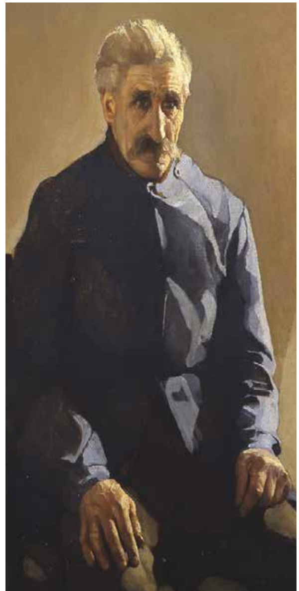
The Refugee by Norah Neilson Gray (1882-1931)

The Glasgow corporation committee also followed the conventional charitable route by setting up a volunteer ladies' committee which organised regular fund-raising events including flag days, music and sporting festivals and sales of lace work made by refugees. There was also a scheme introduced in March 1915 for Scottish school children to give regular weekly donations via a little pledge card to increase funds. By May, over £1,700 was raised through the collection card scheme